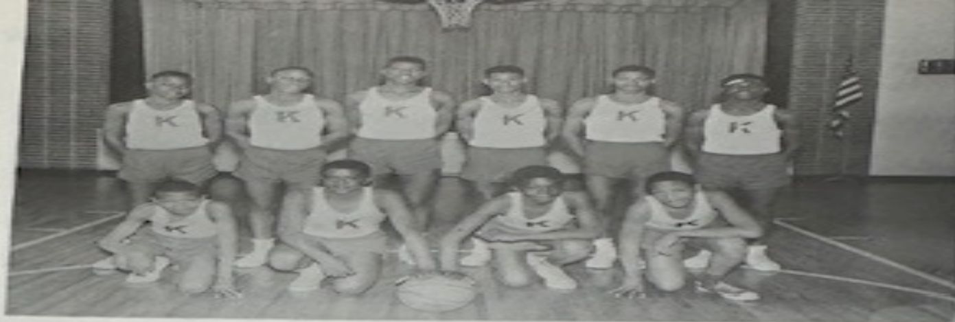
"THE MIGHTY HAWKS"