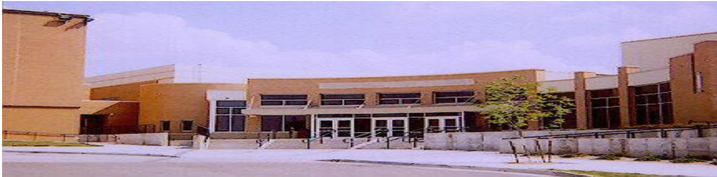
Park Hill High School