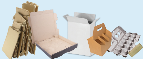
Cardboard & Boxboard (Clean & dry)