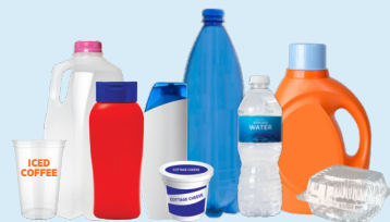
Plastic Bottles, Jugs, Tubs, & Lids (Empty kitchen, laundry, & bath containers & clamshells)