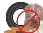
WOOD, WASTE, OR TIRES