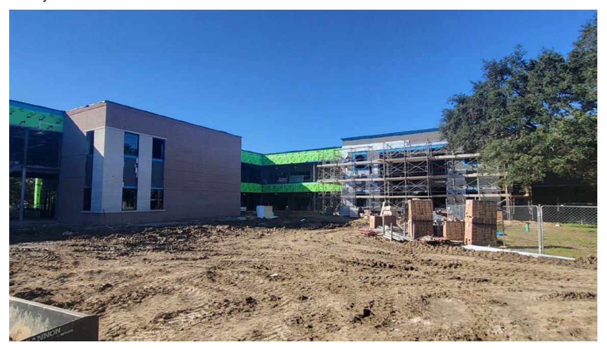
Courtyard View thru Oak Trees to Art/Science and Dining