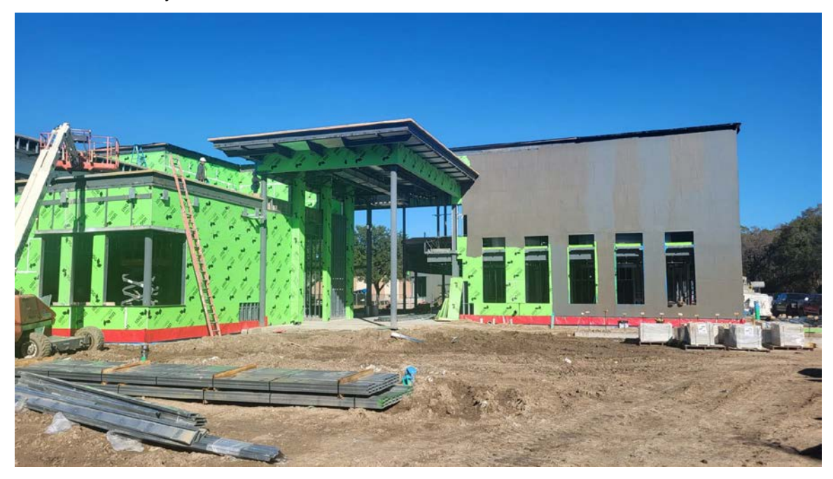
Area C East Elevation Waterproofing