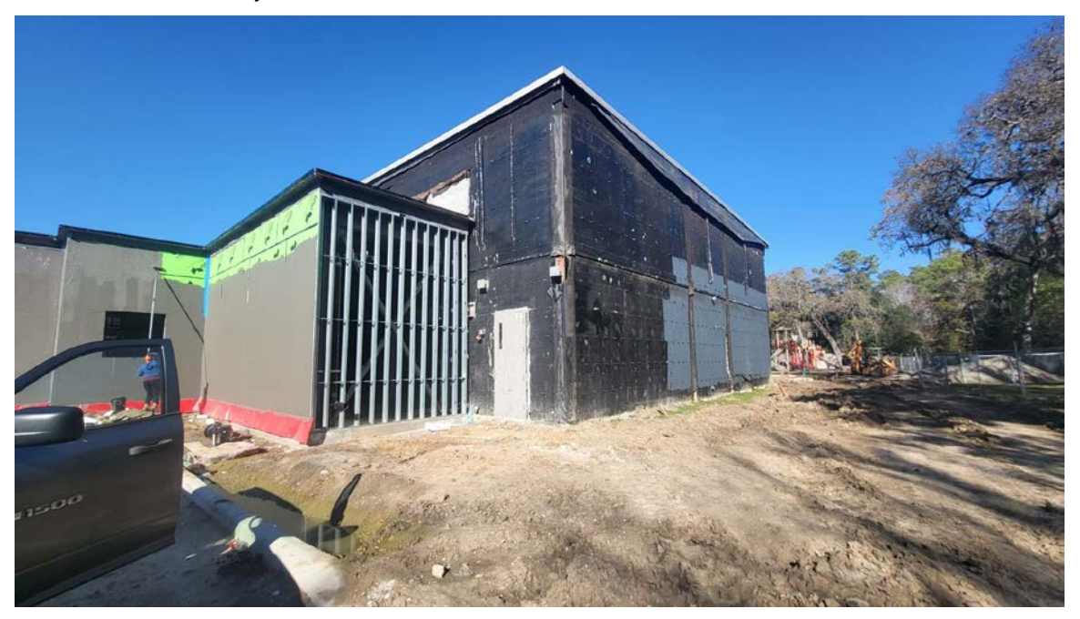
Area F Masonry at North Elevation