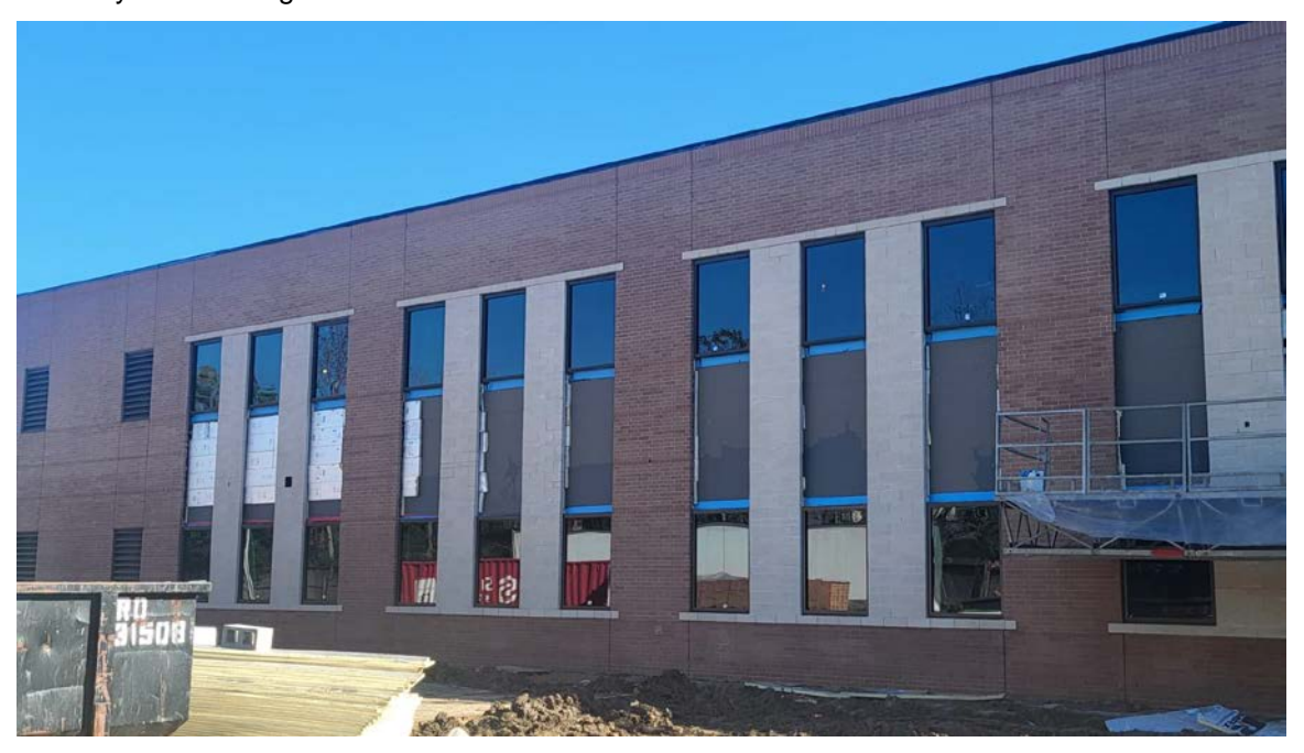
Masonry and Glazing Installed – Southwest Corner – Former Entry Location