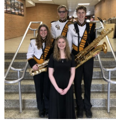
Columbiana County Honors Band & Choir