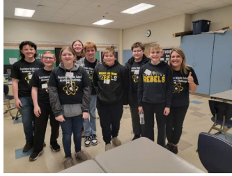
CMS Academic Challenge— 2nd place in Columbiana County