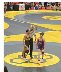
Boys OHSAA State Wrestling Tournament DIII