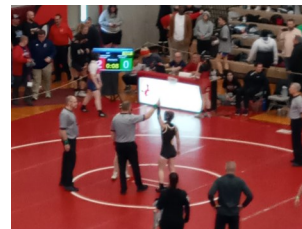
Girls District Wrestling Tournament DIII