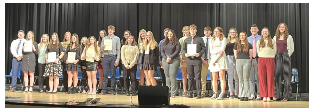
Crestview National Honor Society Members