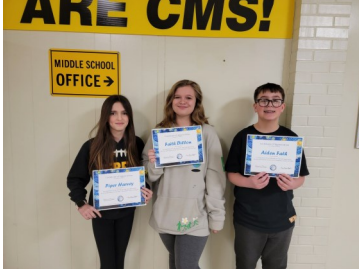
Columbiana County Art Show Participants