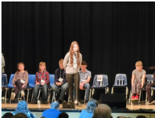
CMS Spelling Bee Finalists @ County Bee