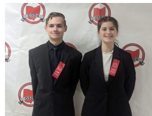
Speech & Debate State Competition