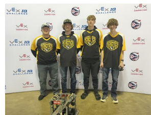
VEX Robotics State Competition