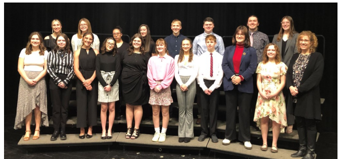
French Honor Society Members