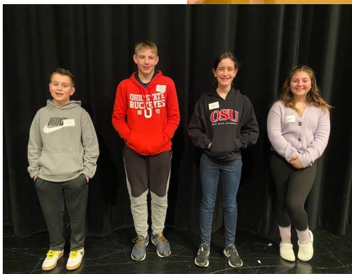
CMS Spelling Bee Finalists