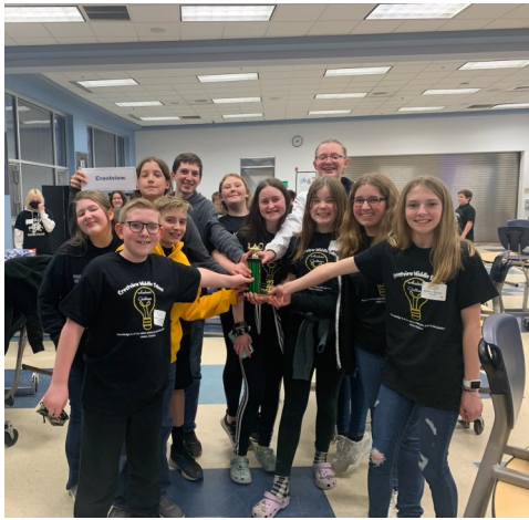
CMS Academic Challenge—2nd place in Columbiana County