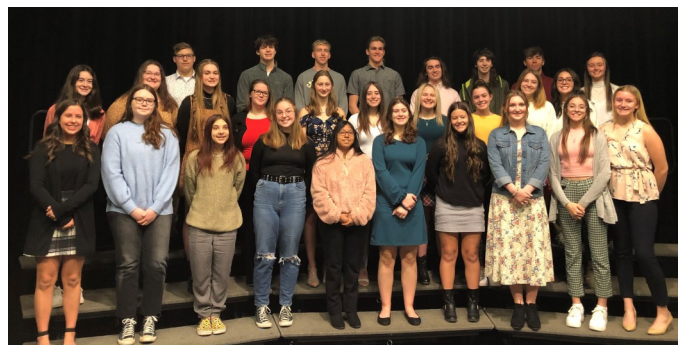
Spanish Honor Society Members