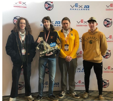
VEX Robotics @ State Competition