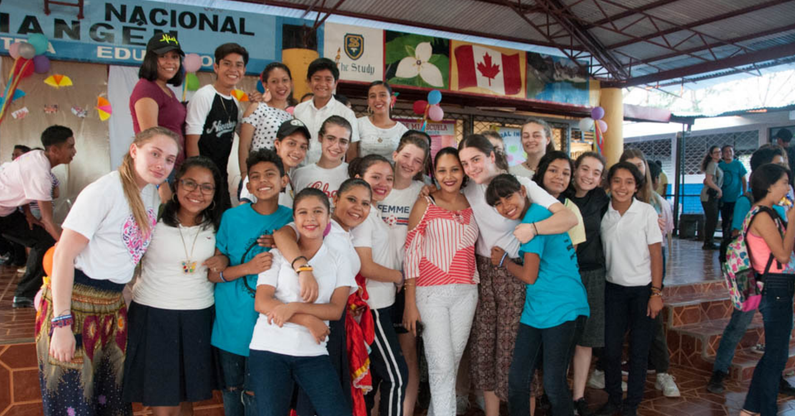
2018 Community Service Trip - Last Day at the Diria Institute