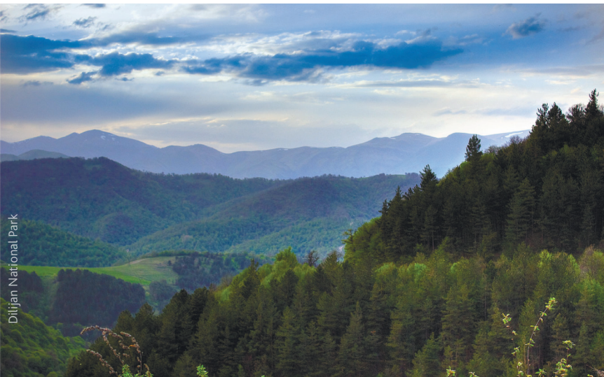
Dilijan National Park