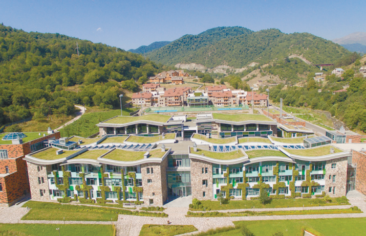
UWC Dilijan Campus