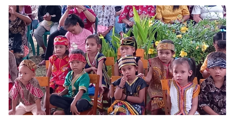
Kindergarteners at the Handmaid school in Sukaria