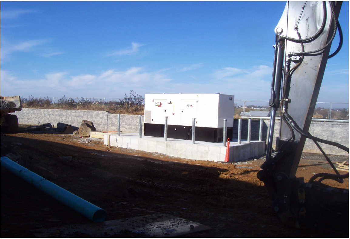
Page 7 1/4/2024