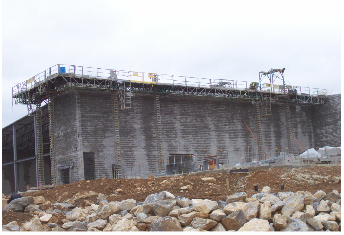
Page 6 1/4/2024