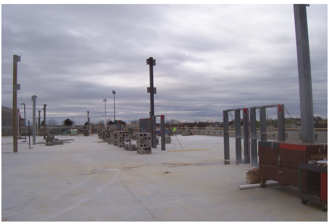
Page 5 1/4/2024