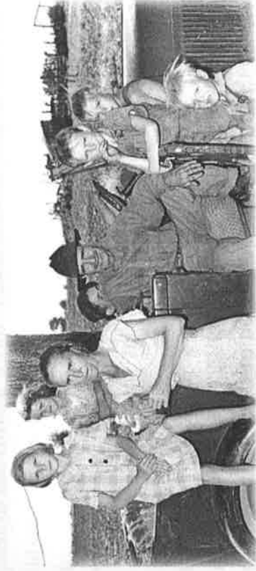
A family travels by car to look for work during the Great Depression.

During the 1920s, many Americans invested their money in stocks, which are shares of ownership in companies. The stock market "crashed" in 1929 when the value of stocks suddenly fell to almost nothing. As a result of the crash, many banks were forced to close, and millions of people lost their savings, jobs, and even their homes. The years of economic hardship and struggle that followed are known as the Great Depression. The Great Depression only ended in the United States after America entered World War II at the end of 1941.