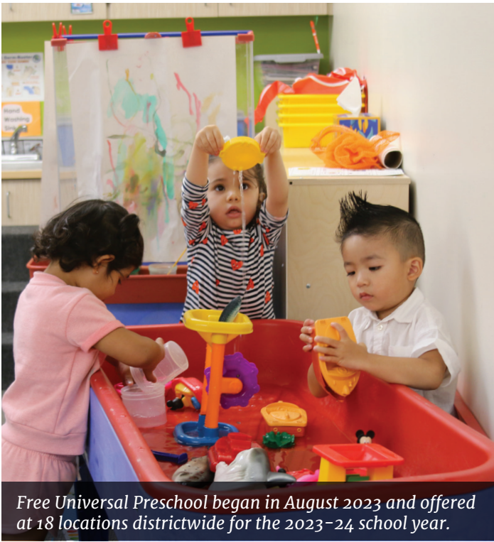
Free Universal Preschool began in August 2023 and offered at 18 locations districtwide for the 2023-24 school year.