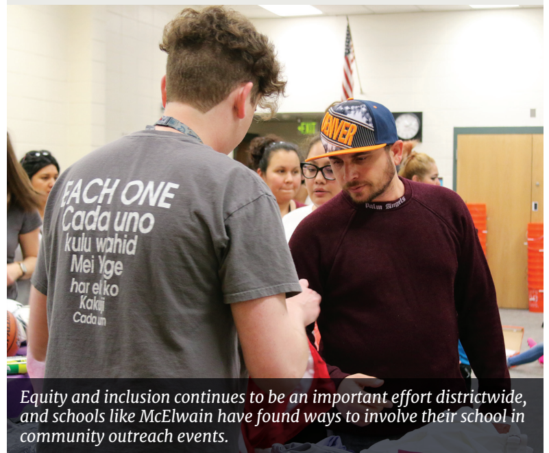
Equity and inclusion continues to be an important effort districtwide, and schools like McElwain have found ways to involve their school in community outreach events.