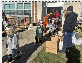
Visits from Chuck E. Cheese & Mickey Mouse