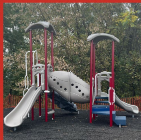
Playground Installation at Cheesequake and at Selover