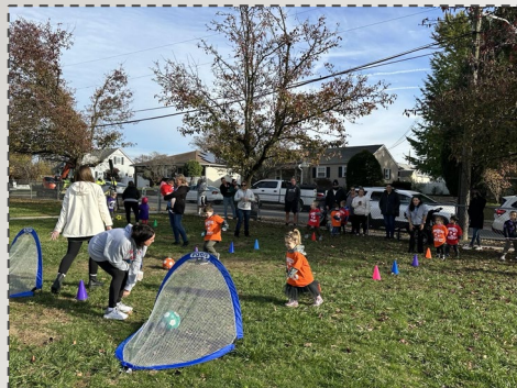
Unified Soccer at Cheesequake and Selover