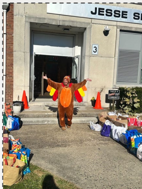
Turkey Trot with Bombers Beyond 2023