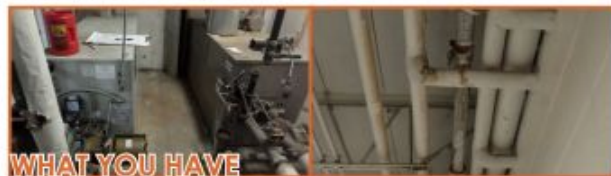
WHAT YOU HAVE