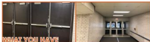
WHAT YOU HAVE