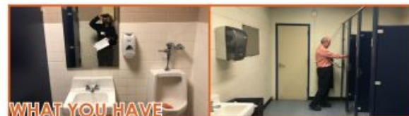
WHAT YOU HAVE