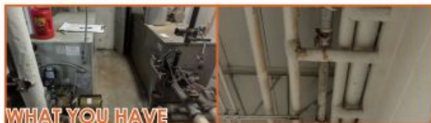
WHAT YOU HAVE