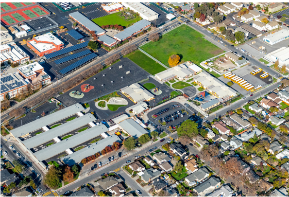
College Park Elementary School