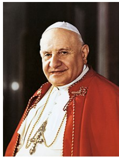
Pope Saint John Paul XXIII Feast day: October 11th

"Consult not your fears , but your hopes and dreams ."