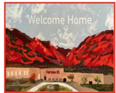
Painting by: Lynn LiCalsi