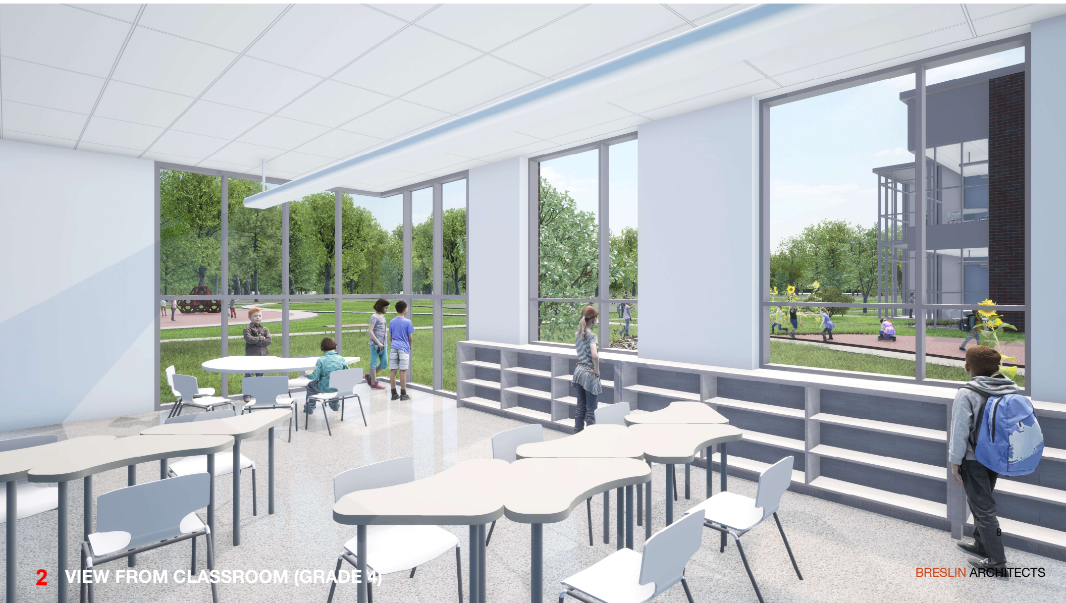
2 VIEW FROM CLASSROOM (GRADE 4)