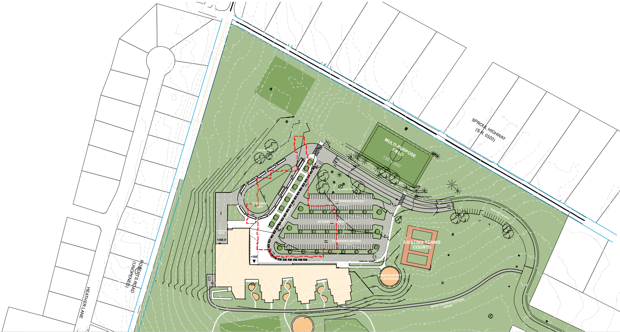
SITE PLAN – OPTION 2