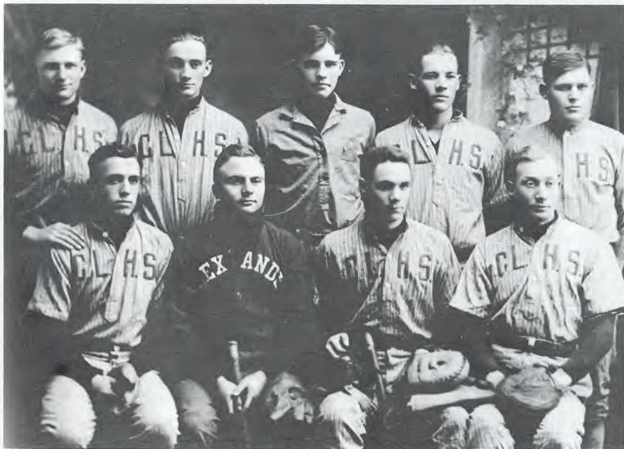
CLEAR LAKE HIGH SCHOOL BASEBALL TEAM

The 1951-52 basketball season was a so-so one until the District Tournament Week. Our record at that time was eight wins and seven losses. On the Friday night before the District Tournament we were beaten at home by Strandburg 55 to 33. They