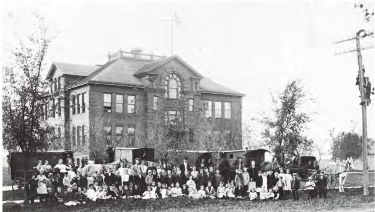
Rural School Children in front of Clear Lake School 1904-1905. Note the horse drawn vans.

"Tuition for non-resident students $1.50 per