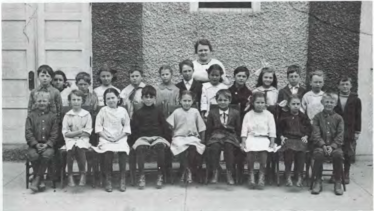
Elementary grade school class in front of fire barn end of city hall in the late 1920's.