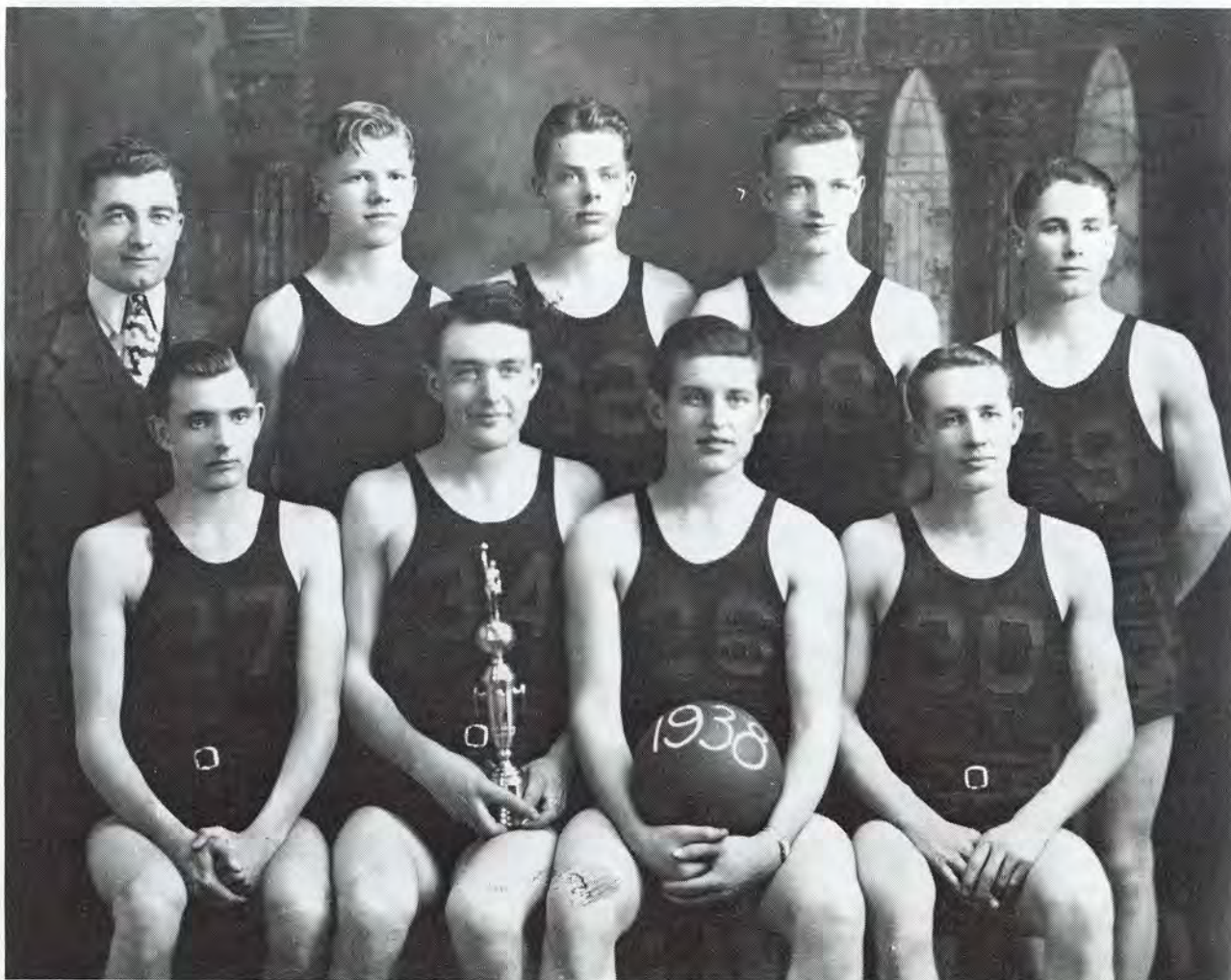
DISTRICT HIGH SCHOOL BASKETBALL CHAMPIONS IN 1938

Thank you for the opportunity to share in the Clear Lake history. I well appreciate the monumental task, individuals, committees and the community has in building the Centennial into a successful event. My wife and I plan to participate. Don't be surprised if you see us in the parade in my Model A Ford Coupe.