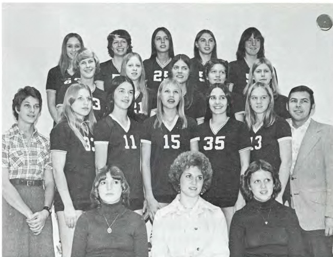
1976 STATE "B" GIRLS BASKETBALL TEAM