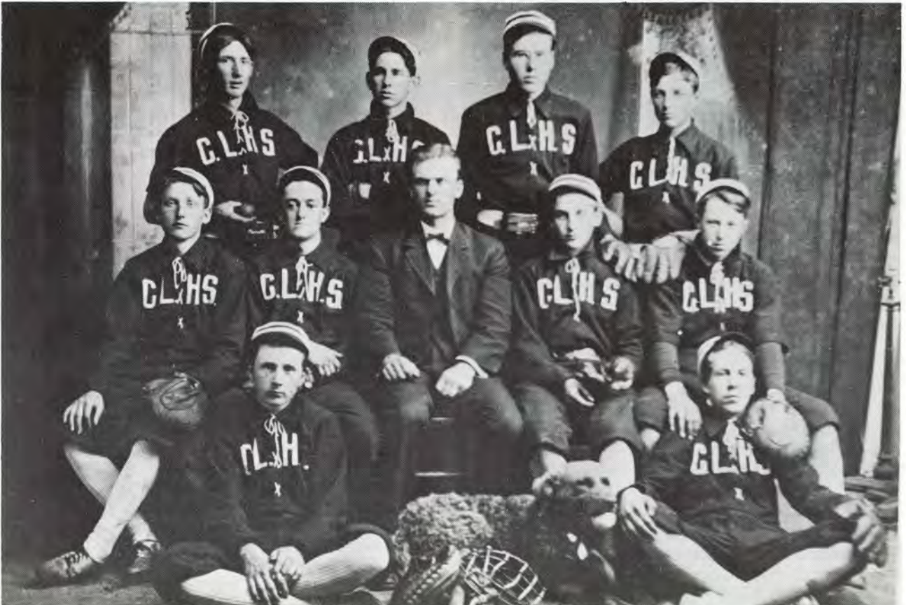
CLEAR LAKE BASEBALL TEAM IN 1907