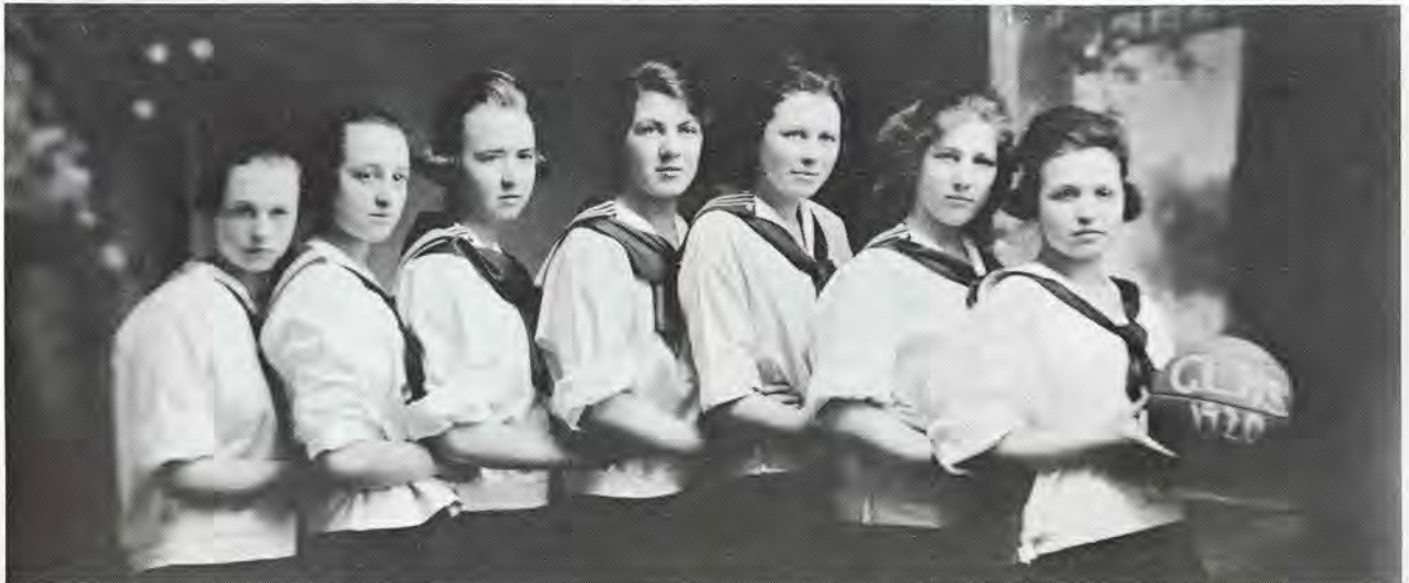
CLEAR LAKE HIGH SCHOOL GIRLS BASKETBALL TEAM—1920