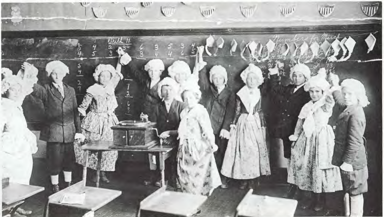
Clear Lake Grade School class holding a George Washington birthday party about 1914.