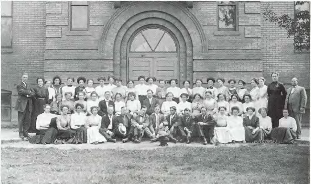
Deuel County Rural Teacher's Institute in front of Clear Lake Grade School—1916