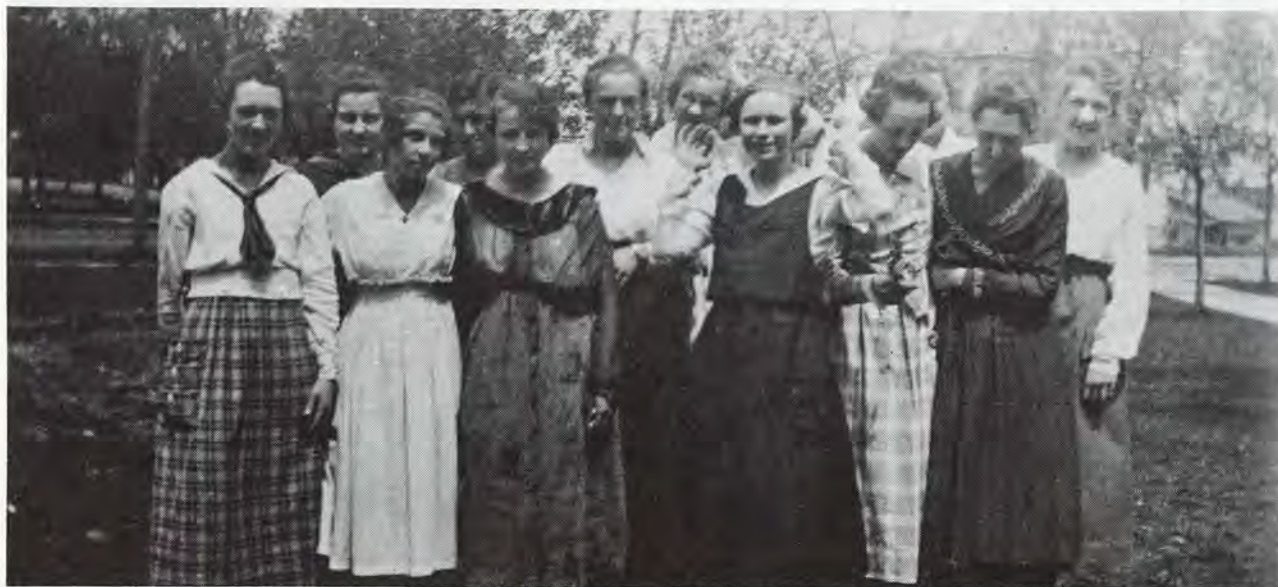
HOME EC CLASS OF JUNIORS - MAY 1919