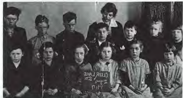
GRADE II - 1917