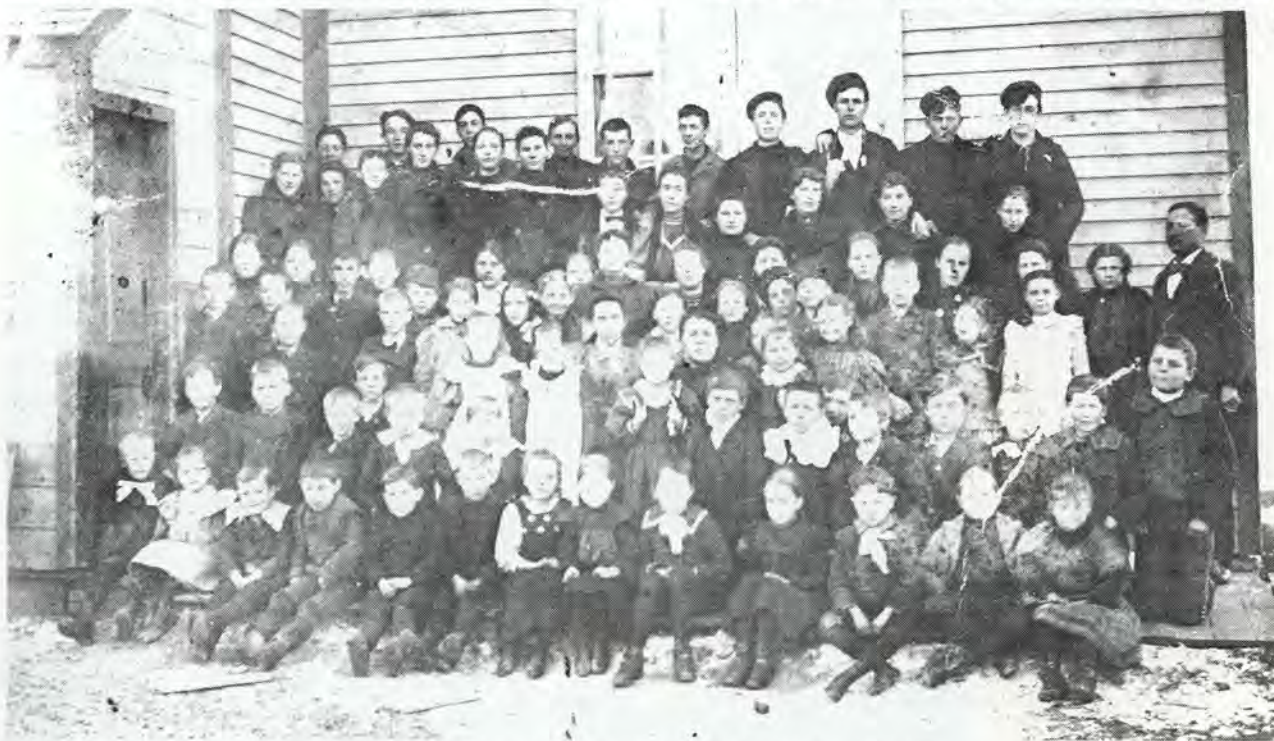
CLEAR LAKE HIGH SCHOOL STUDENTS—1898-99