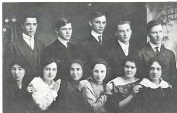
CLEAR LAKE HIGH SCHOOL GRADUATING CLASS IN 1915