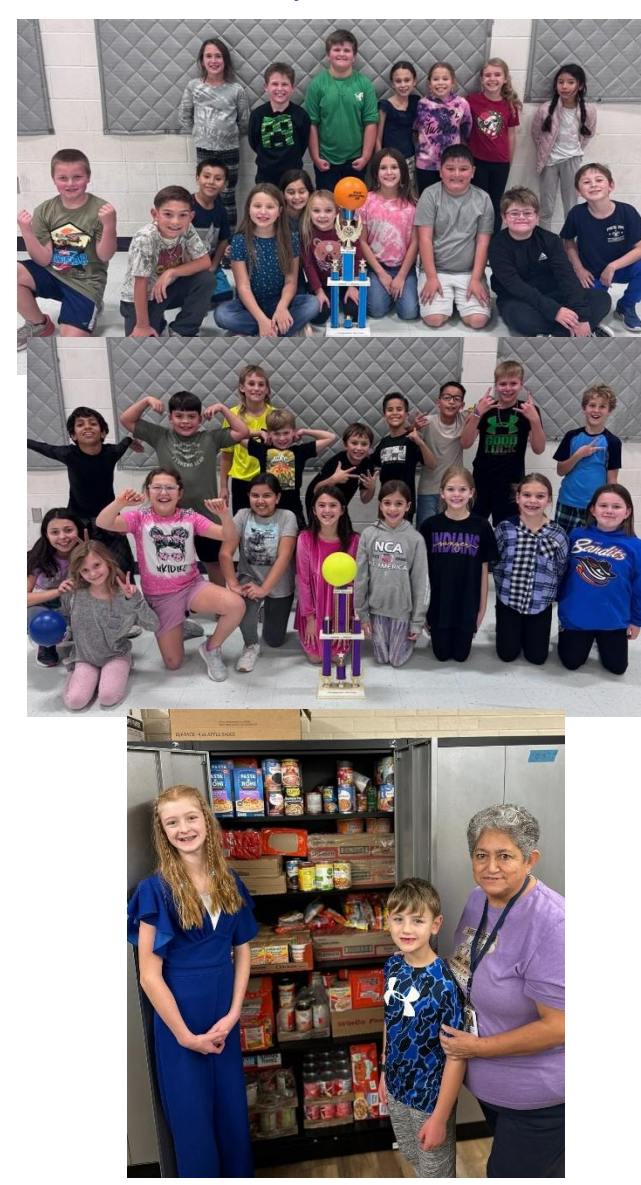
Winter Wonderland Volunteers