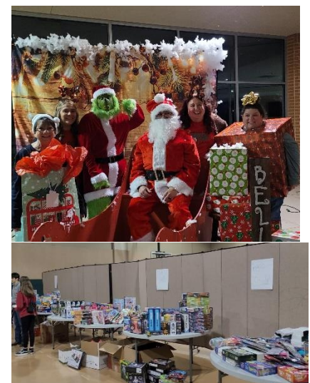
It's A Winter Wonderland!

Then with a glimmer of hope, he arrived with a donation of $2,191 for the Community Outreach Department to assist all families in need. Thank you and we look forward to our continued partnership in Education.