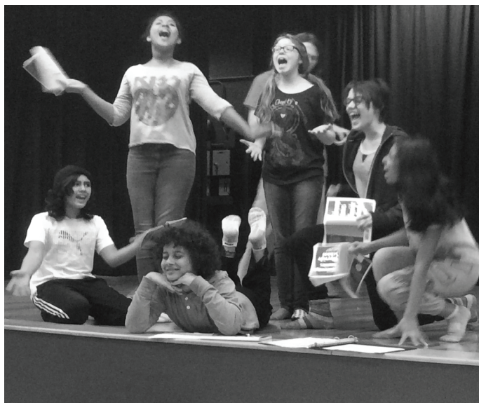
A very enthusiastic play rehearsal

"We have a top-notch cast," said theater teach-