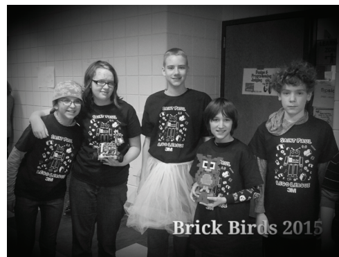
The Brick Birds

"We used our experience from last year to build upon the team and make it better this year, we were able to get more people and get