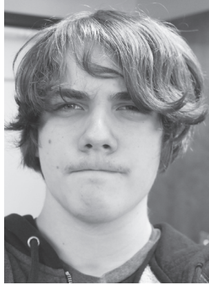
Antonio Carvale Staff Columnist

As prophesied by legitimately everyone the iPads are here splitting the school in twine as students fight for their right to party and/or play games on their iPads during class.