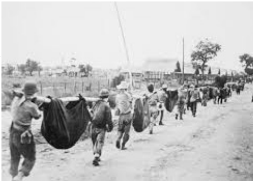
The Bataan Death March

On December 9th, OWLs graduating class was forced to march from their positions at Open School to the neighborhood house prison camp.