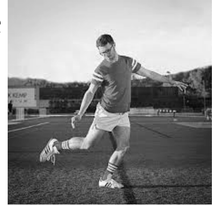
The funk band's latest album

If you like Earth Wind and Fire (the best band in the world) or James Brown (another funky dude) you're gonna love Vulfpeck. They bring a new modern revival to classic funk in a fun, upbeat way. They've got interesting rhythms, catchy choruses and downright grooves. And also some of their stuff is completely instrumental so when your