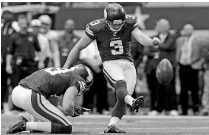
Blair Walsh kicking.