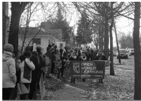
OWL seniors at their march

Along the way all but 46 of them died, whether