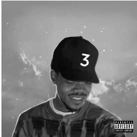
Chance the Rapper's album, Coloring book

It surprises the hell out of me how someone that spends hours upon hours