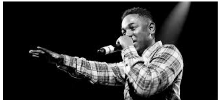
Rap idol Kendrick Lamar

In conclusion, I think we all need to study different types of music and art forms before we judge it. You do not have to like a type of music but that doesn't mean you can be disrespectful about your opinion and provide no evidence to back why something is "not respectable". For many hip hop is part of someone's culture and upbringing and it could hurt someone to hear that their culture is "despicable and unrespectable" and in all honesty