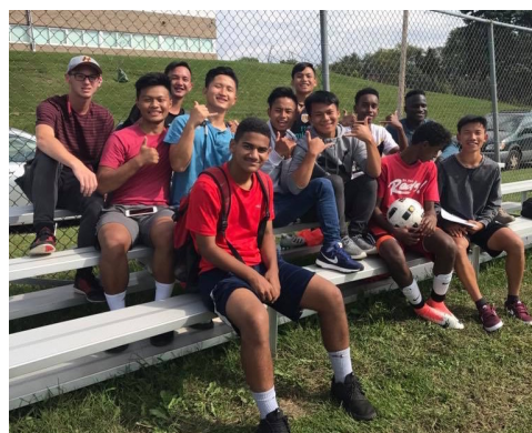
Boys' soccer team cheers on the girls' soccer team

Winter sports registration will begin in early November offering both girls' and boys' basketball, wrestling, and boys swimming . Students wishing to play a sport must have a recent health physical on file with the school. Look for an "Athletics" table during fall conferences for