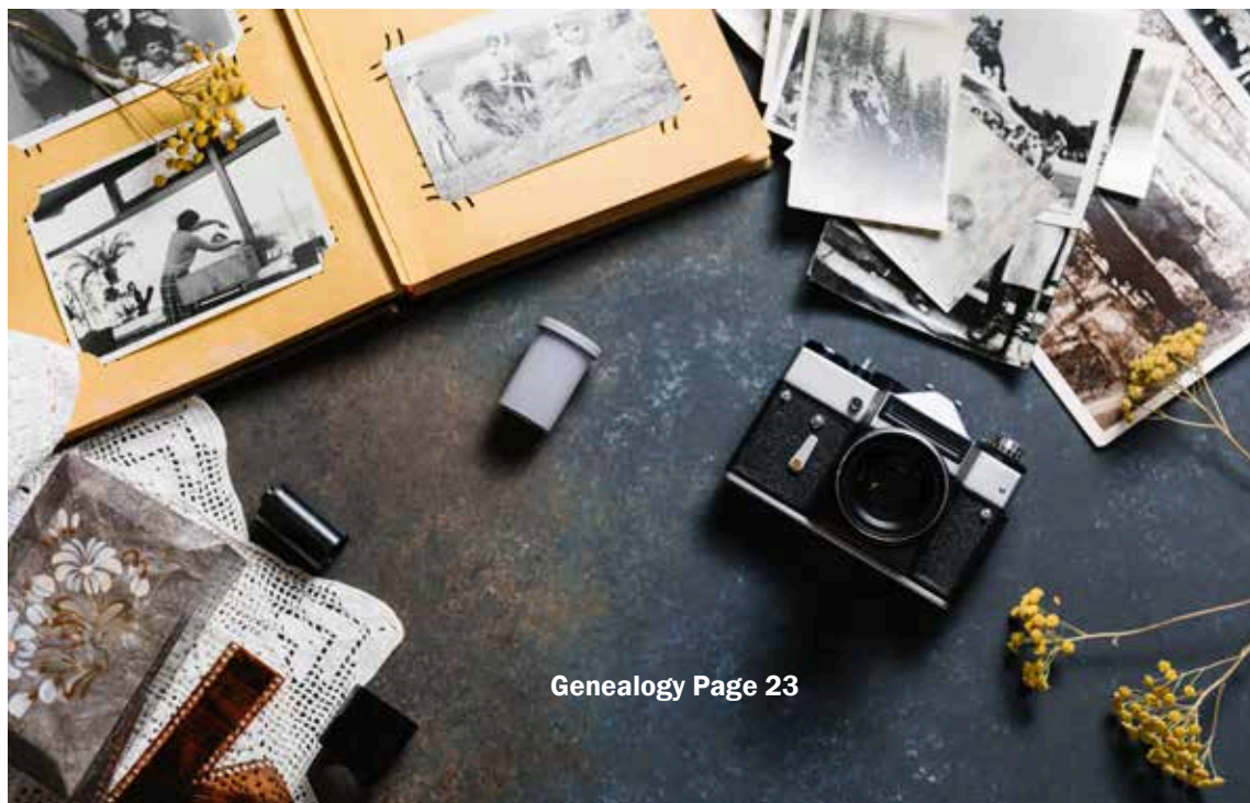
Genealogy Page 23