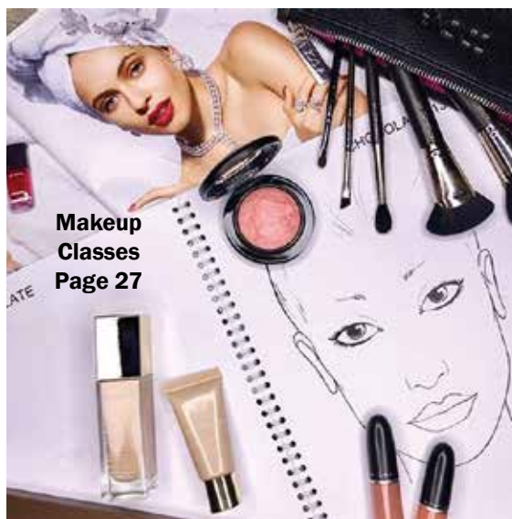
Makeup Classes Page 27