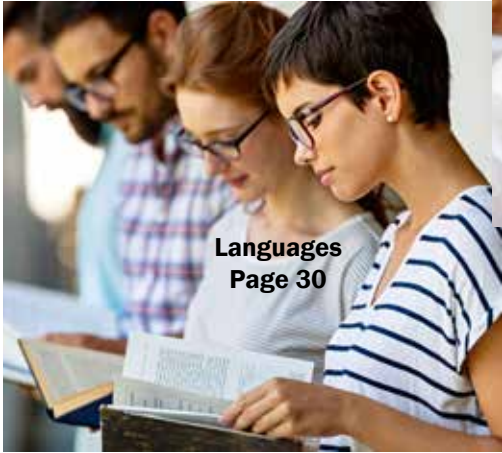
Languages Page 30