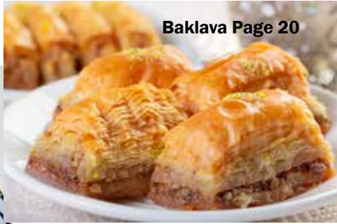
Baklava Page 20

Avoid the disappointment of a canceled class, register early! Register online today at