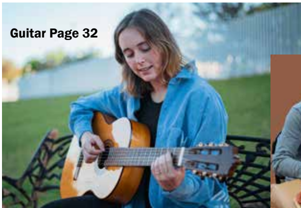
Guitar Page 32