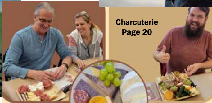
Charcuterie Page 20