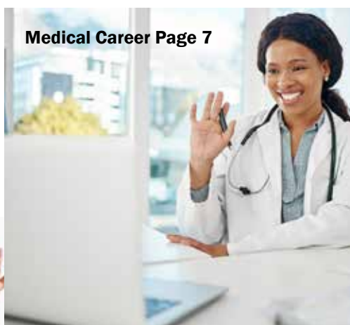
Medical Career Page 7