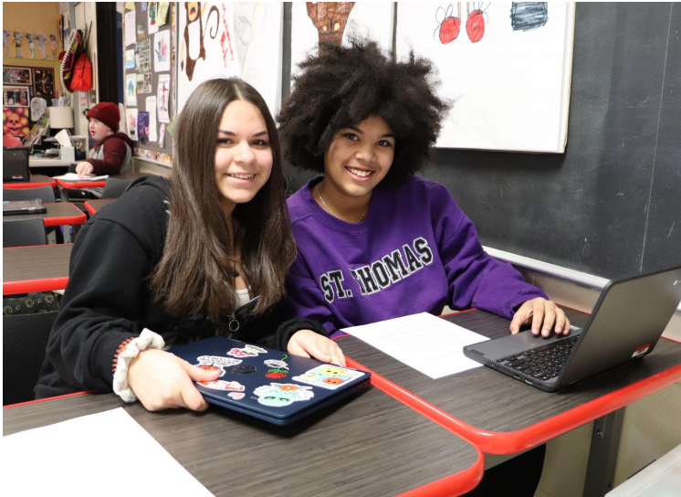
Pony Red Team