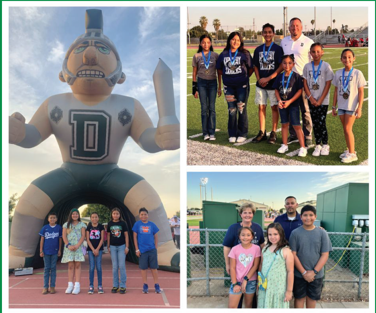
Students who received perfect attendance in the 2022-2023 school year were recognized at the DHS Football game!