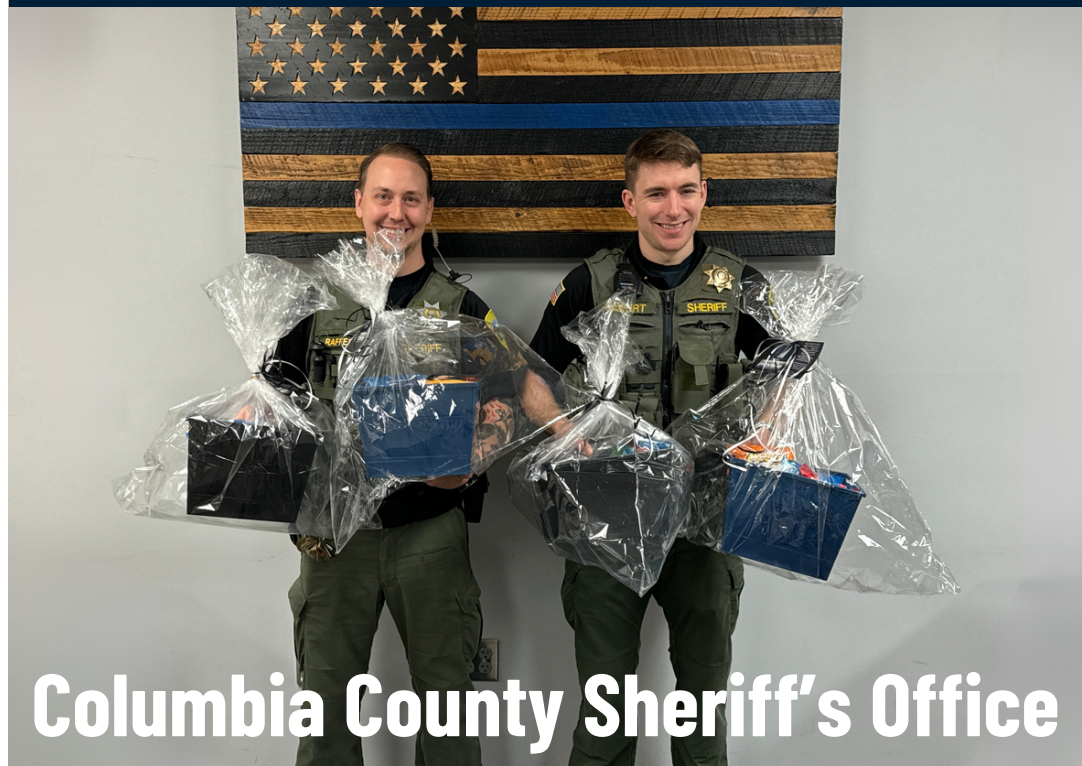
Columbia County Sheriff's Office