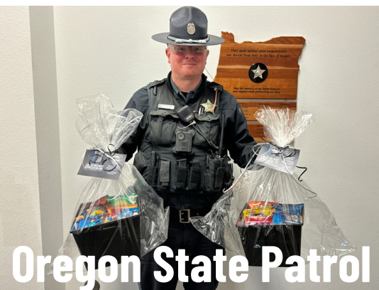
Oregon State Patrol