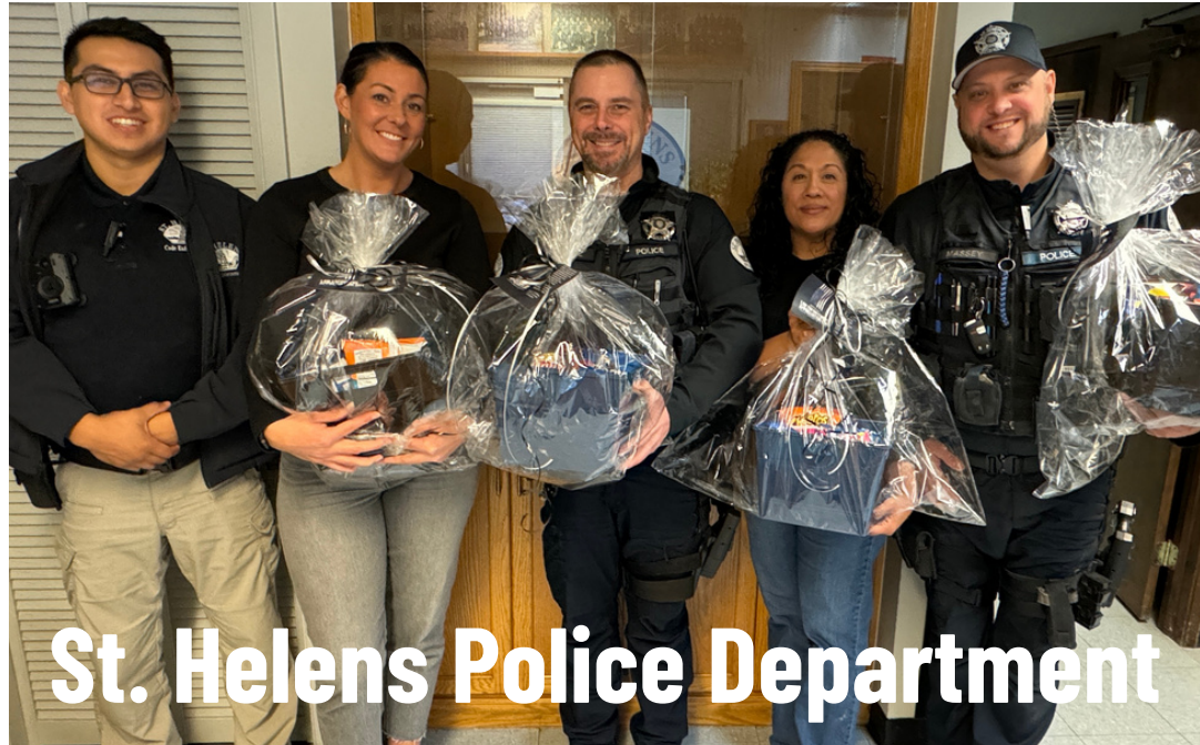
St. Helens Police Department