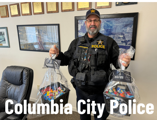
Columbia City Police