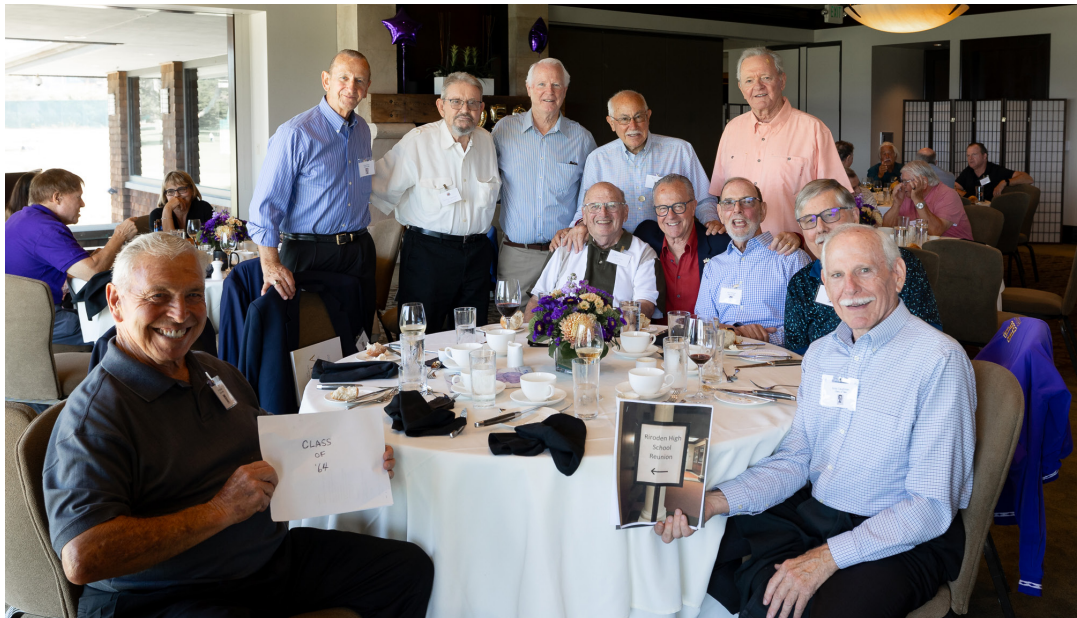
Class of 1964

Save the date for next year's Golden Graduate Lunch at Lake Merced Golf Course on Wednesday, August 28, 2024!