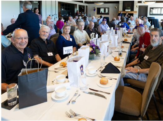
Class of 1953