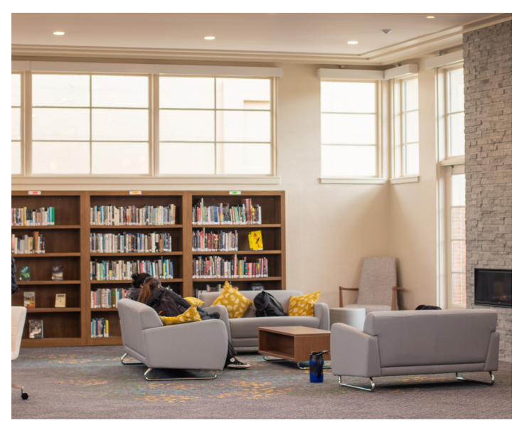
The Student Learning Center features stadium seating that provides study space with outlets and USB ports, as well as space for presentations when the overhead screen comes down from the ceiling. There is also rest and relaxtion space that features couches and a gas fireplace.