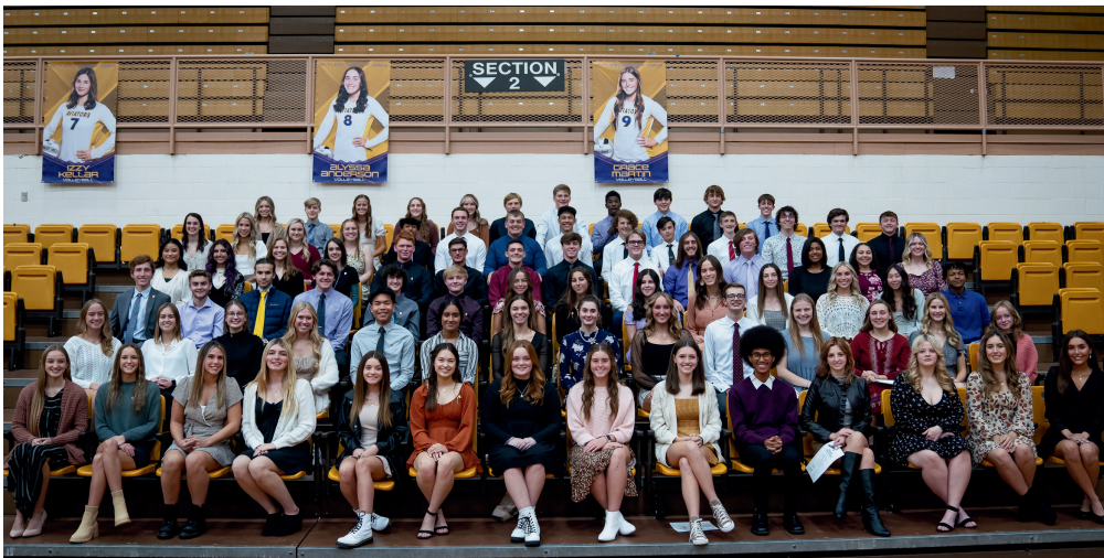
56 New Members were inducted into the National Honor Society