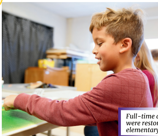
Full-time art and music were restored at the elementary level.

PLTW provides transformative learning experiences for students and teachers. Students are engaged in hands-on STEM activities and projects while being empowered to solve real-world problems. PLTW is a nationally recognized STEM curriculum program.