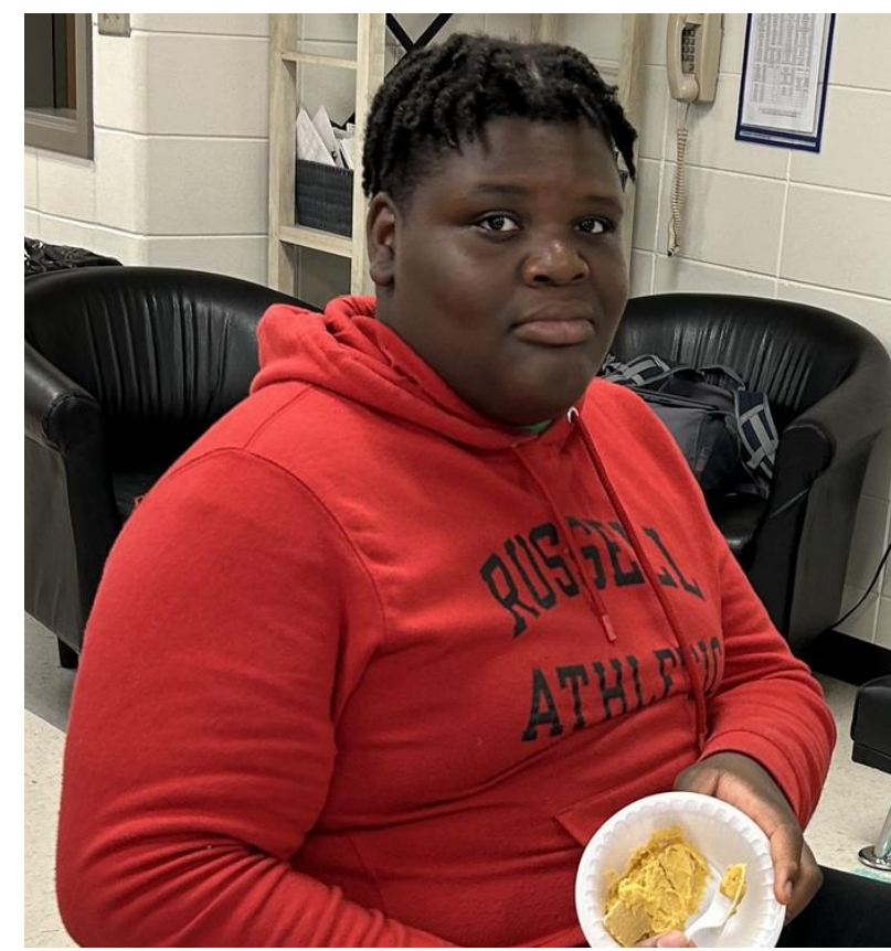
Enjoying the Sweet Outcomes!