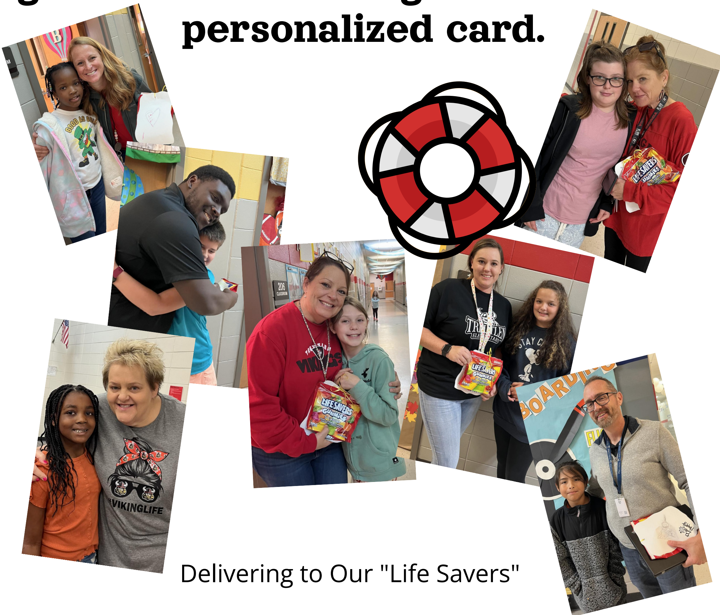
Delivering to Our "Life Savers"

In November, the Treutlen Elementary and Middle School ABC group initiated a project centered around gratitude, aimed at recognizing our cherished "Life Savers". Students were encouraged to select a special individual at school whom they wished to pay tribute to during the Thanksgiving Season. They then offered the chosen recipients a gift of "Life Saver" gummies and a personalized card.