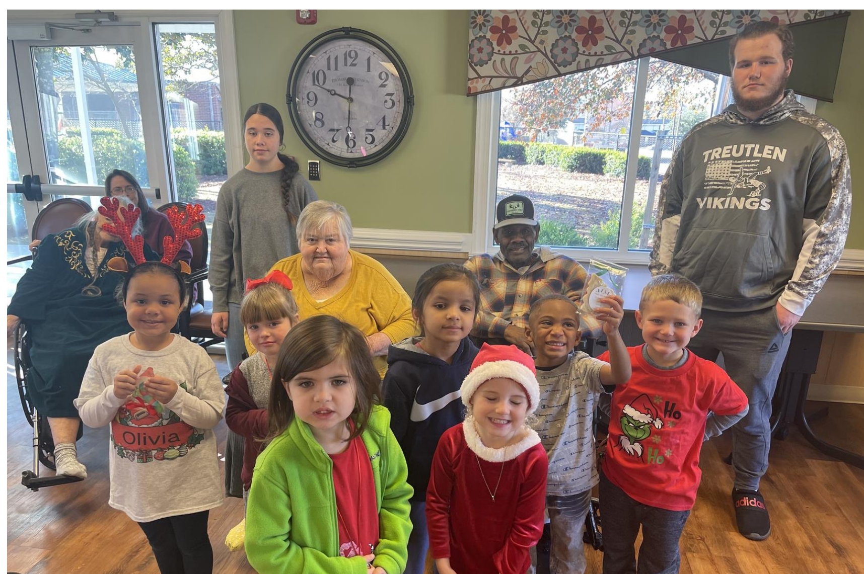
Delivery of Christmas Cookies