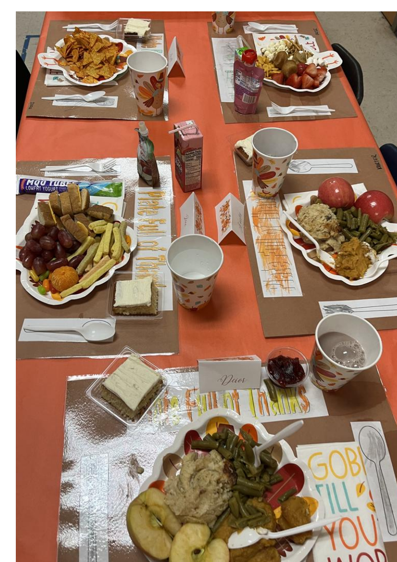
Our Thanksgiving Meal

To celebrate Thanksgiving, our kiddos created personalize placemats and learned to set a table. As a class, we enjoyed a family-style Thanksgiving meal together before our break.