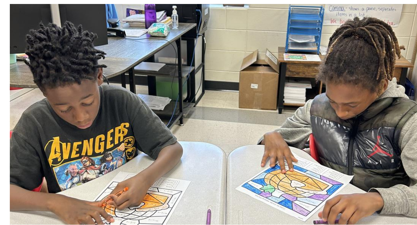
Using Fractions in the Lesson