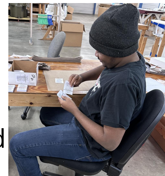
Seeing Graduates in Action and Making Plans for the Future