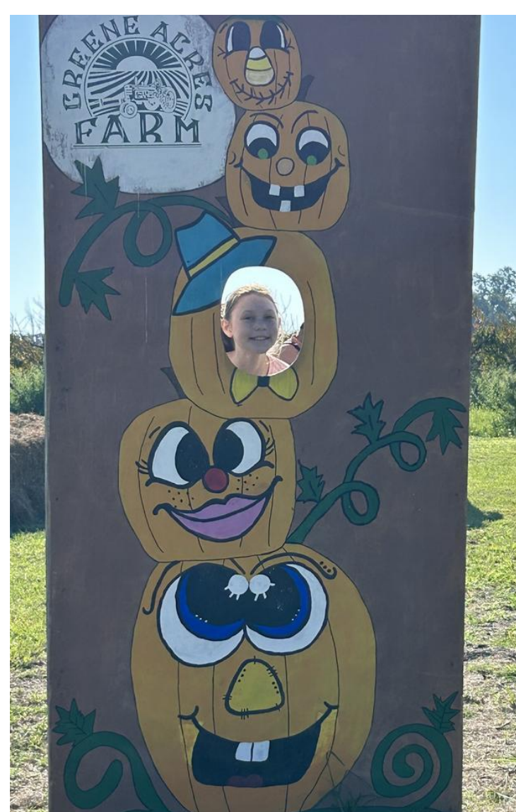
Enjoying the "Fall Frenzy"