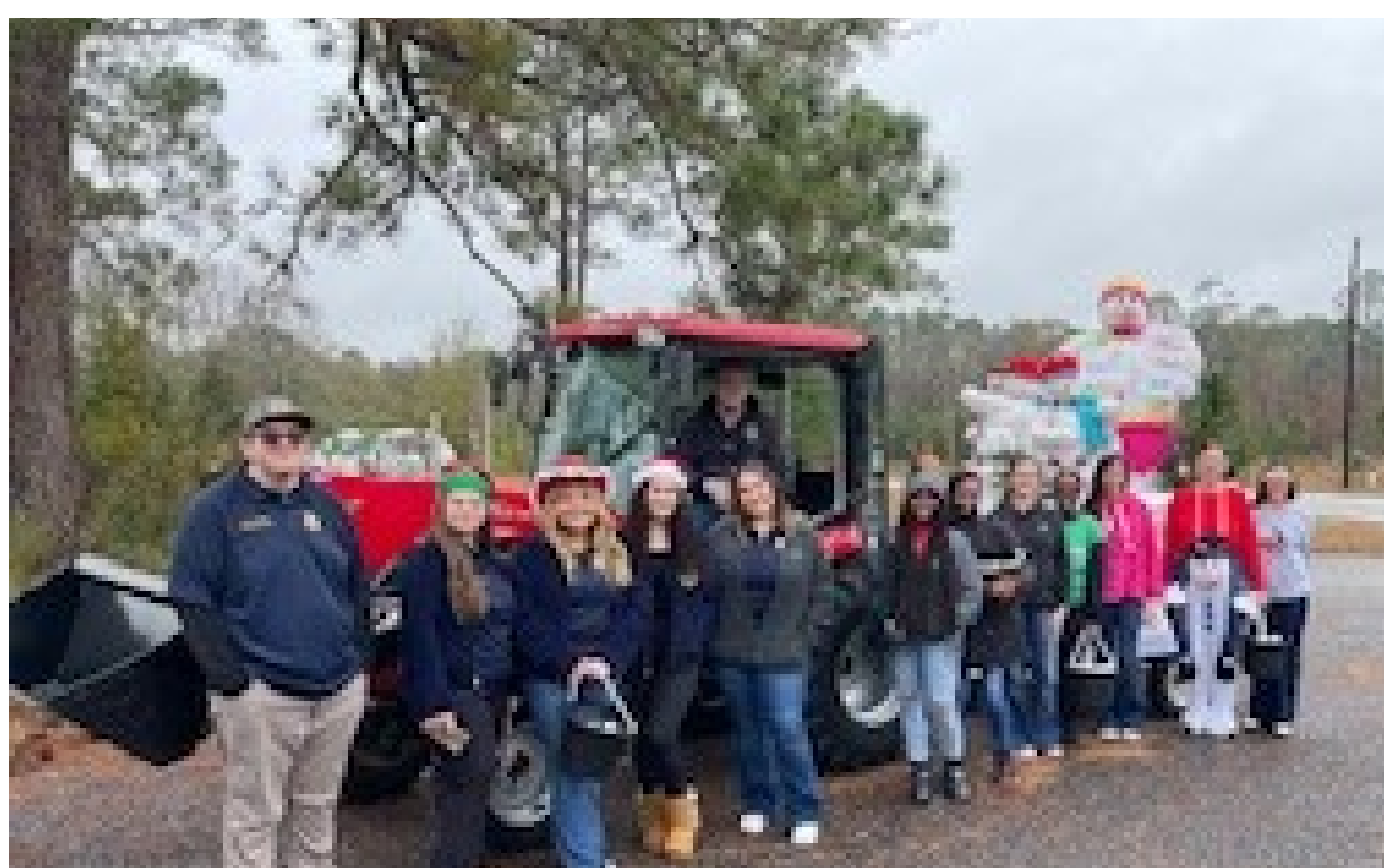
Merry Christmas from CTI!