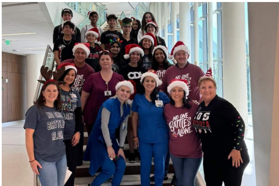
US Students visited Moffitt to bring some holiday cheer to patients currently in care.