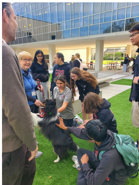
During midterm week, US students were visited by the Alliance of Therapy Dogs for a boost to help get them through testing!