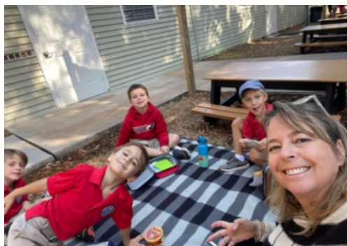
Pedro Miller Upper School