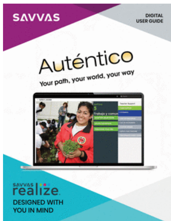
Autentico Digital Walkthrough