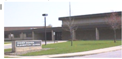
Homer Iddings Elementary School 7249 Van Buren St. 219-650-5302