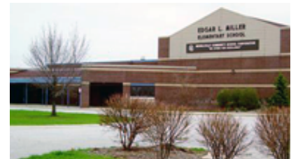
Edgar Miller Elementary School 75901 Waite St. 219-650-5303