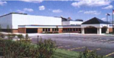
Merrillville High School 276 E. 68th Place 219-650-5307