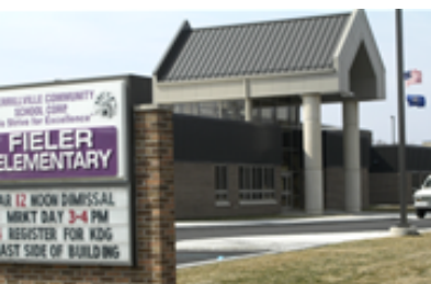
Henry P. Fielser Elementary School 407 W. 61st Ave. 219-650-5301