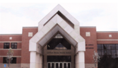
Clifford Pierce Middle School 199 E. 70th Street 219-650-5308