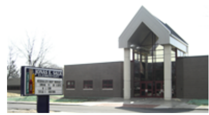
Jonas Salk Elementary School 3001 W. 77th Avenue 219-650-5304