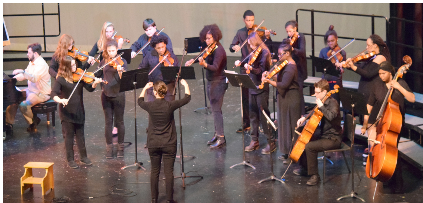
University City High School orchestra, band and choir perform “Lift Every Voice and Sing” by James and John Johnson.

MLK CENTER-SPREAD CONTENT PRODUCED BY UNIVERSITY CITY HIGH SCHOOL STUDENTS