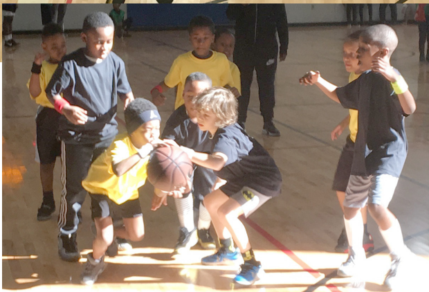
The newly-established University City Youth Basketball Program provides local training and competition experiences for 60 athletes.

Also being included under this committee’s umbrella of programs is Cardinal Care’s Redbird Rookies summer program that began in 2004. This free, noncompetitive, co-ed baseball/softball program is for youth ages 5-13 years old.