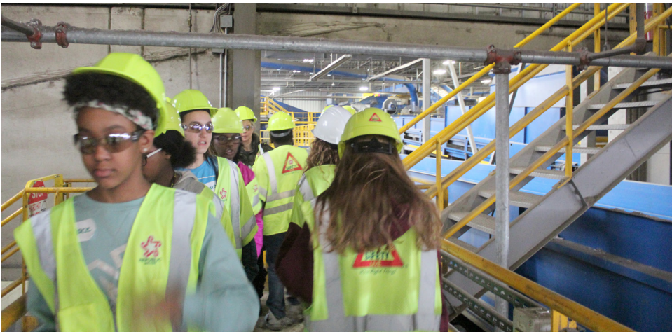
Students from Brittany Woods Middle School’s New Environmental Club visited the St. Louis County Department of Public Health’s recovery facility in preparation for developing the school’s recycling program.

Brittany Woods Middle School, Eighth Grader