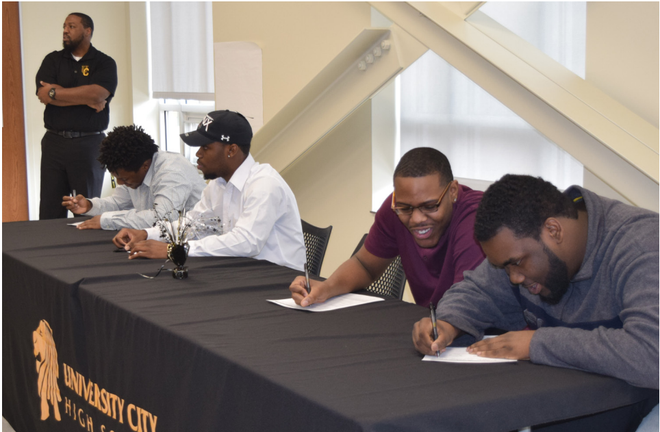
On Feb. 7, 2018 National Signing Day at University City High School, four UCHS senior football standouts signed letters of intent to play for their respective colleges as freshmen in the fall of 2018.