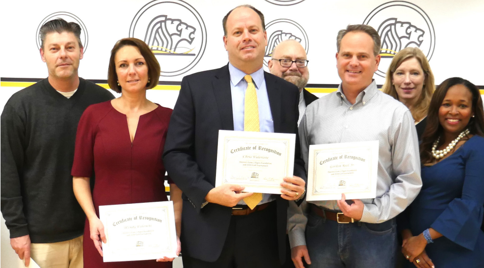
The University City Board of Education publicly recognized the leaders of the Darren’s Lions 2 Tigers Foundation, Inc. at the Feb. 15, 2018, school board meeting. They were acknowledged for their generous support in providing scholarship funds for UCHS students attending the University of Missouri - Columbia.