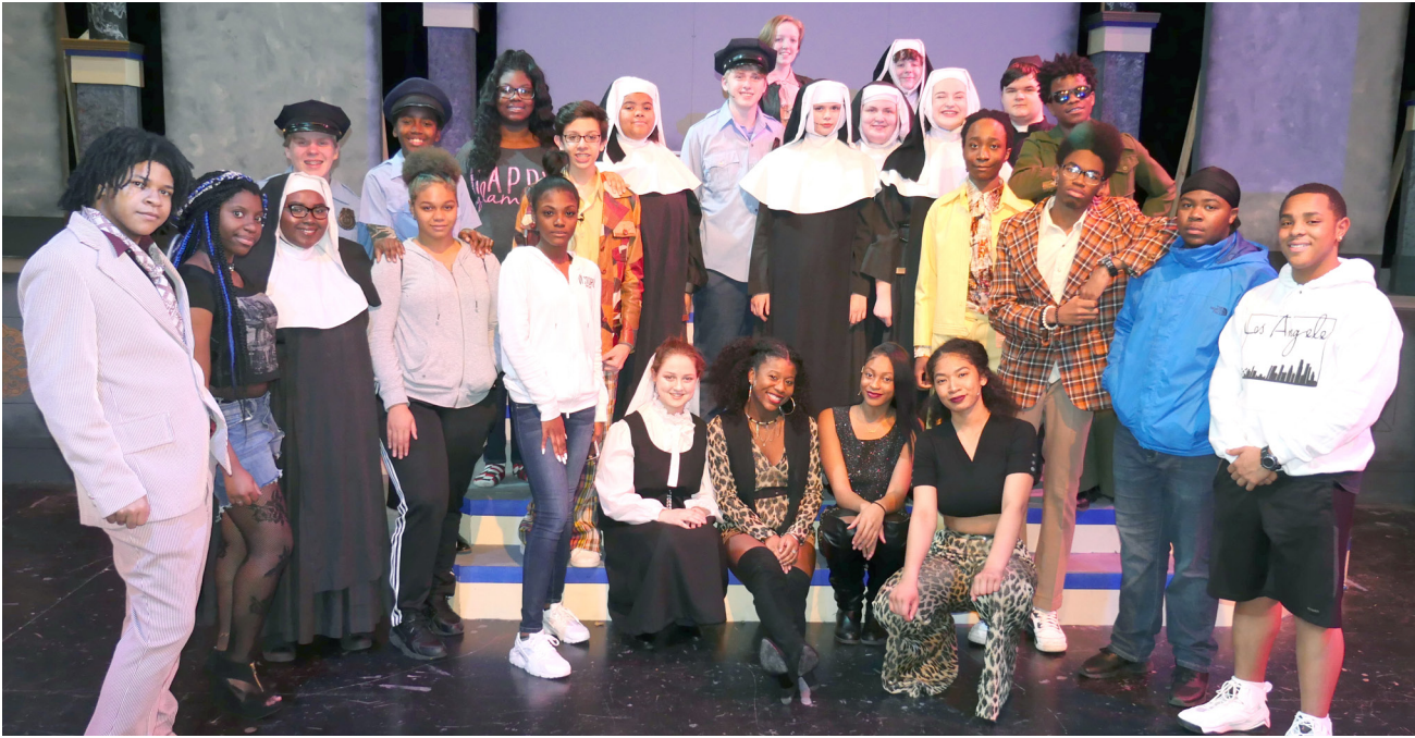
Cast and crew of UCHS’ annual spring musical, Sister Act, offered outstanding performances.