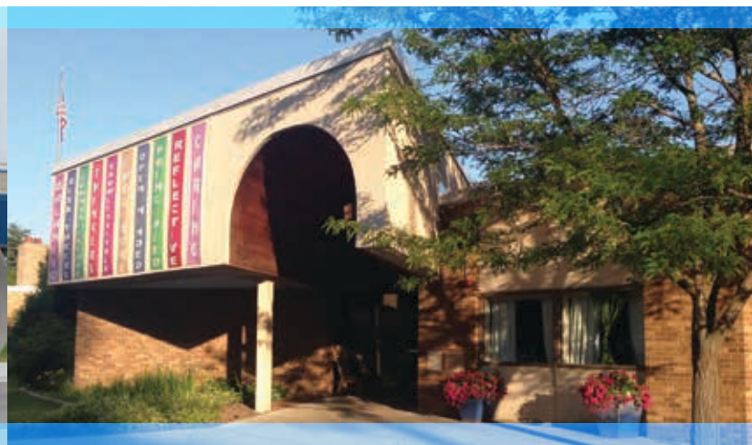
LILA's Main Campus houses the Lower School for grades K-5. It features a full-size gymnasium and stage and a modern media center with computer labs and interactive technology.