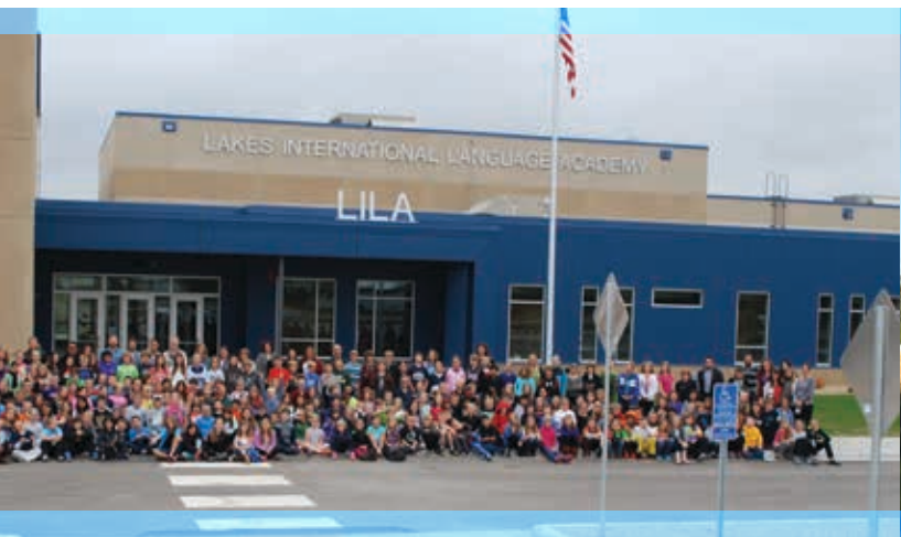
The LILA Headwaters Campus opened in 2014 and serves Upper School students with bright classrooms, flexible study and performance spaces, and support for technology.

Lakes International Language Academy (LILA) provides an international education, preparing students with global competence for the 21st century. We offer Spanish and Mandarin language immersion for PreK-5, and continue immersion courses for Upper School students (grades 6-12) who demonstrate proficient language skills. Upper School students with no previous language learning experience or immersion students looking to learn an additional language may choose fast-track courses in Spanish, Mandarin Chinese, and French.