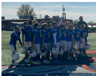
Dragon Football brought home third place in the Super Bowl Tournament.