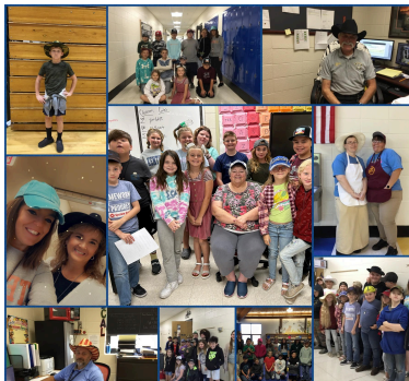
Wednesday, Sept. 27, Red, White, and Blue Day: We wore our red, white, and blue to celebrate the third day for High Attendance Week!