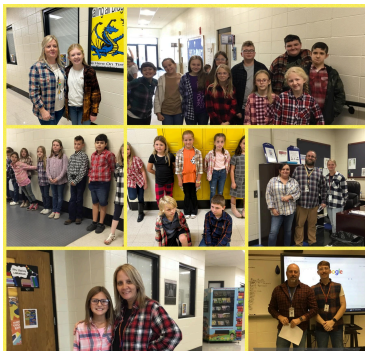
Monday, Sept. 25, Flannel Day: We dressed up in our flannel gear to kick off Spirit Week for High Attendance!