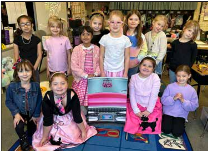
First-grade students dressed up like they were from the 50's for the 50th day of school.