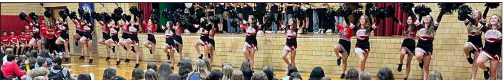
Our fall sports recognition assembly recognized athletes participating in football, cross country, volleyball, and cheerleading.