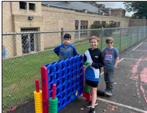
Thank you to all of our community members who donated their time, money and resources to enhance our outdoor classroom for our students!