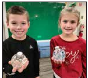
Students created 3-D printed ornaments as part of our STEM program.