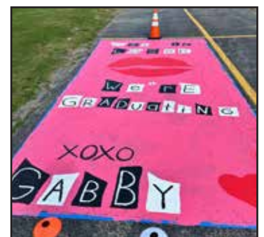
Seniors' painted parking spaces.