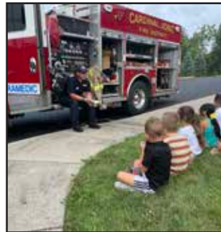
Incoming kindergarten students learned about a variety of topics, including fire safety, during our annual Safety Day in August.