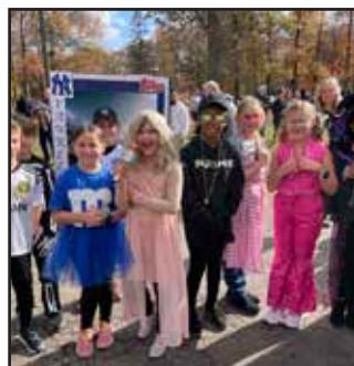
Students showed off some great costumes for our annual Halloween Parade.