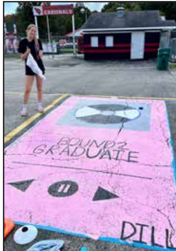
Seniors' painted parking spaces.