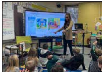
Interactive ViewBoards in our elementary schools enable hands-on learning for our youngest students.