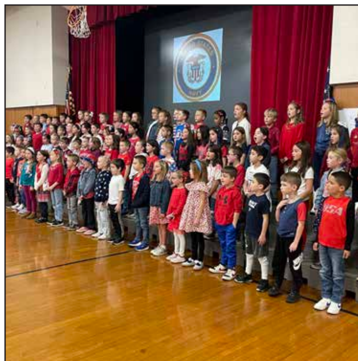
Our annual Veteran's Day Assembly allowed our second-grade students to honor military veterans from all branches of our armed forces.