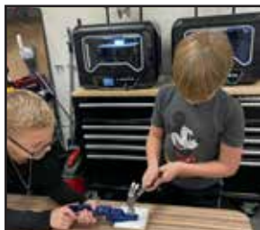
STEM students embraced collaboration during interactive, hands-on projects.