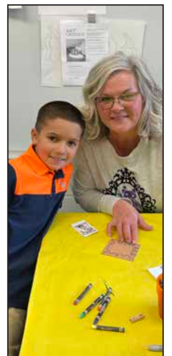
Second-grade students were excited to welcome their grandparents or another special someone, to our annual Grandparent's Day event.