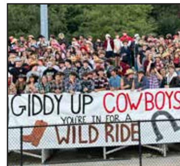
The spirited CHS student section cheering the team on to victory.