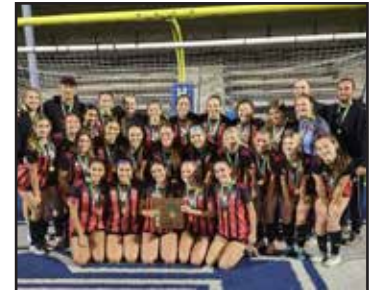
District Champion Girls Soccer team made it to the Regional Finals.