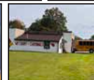
One of our newly purchased school buses, along with our freshly painted mural.