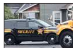
2023 School Bus Safety Day with local law enforcement.

We appreciate your support and look forward to continuing to safely "Carry the Cardinals."