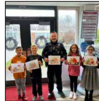
Our school resource officers sponsored a coloring contest with our elementary students this year.