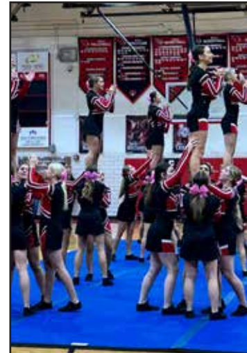
Cheerleaders at the Pep Assembly.