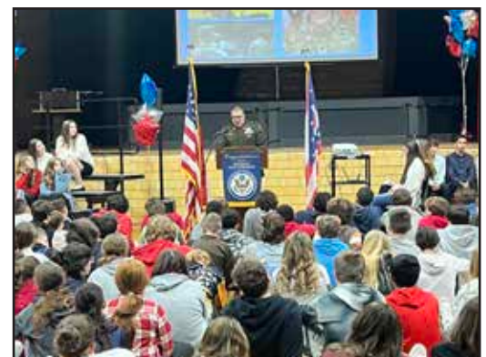
Our annual Veterans's Day is always one of the most special events of the year at CVMS. It is student-led and honors and captures the spirit of our community veterans.