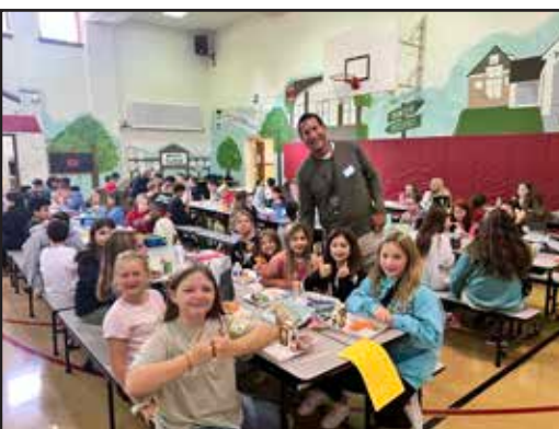
In September, national "Start With Hello" week, a Sandy Hook initiative, gave us the opportunity to mingle with others during grade-level lunches.