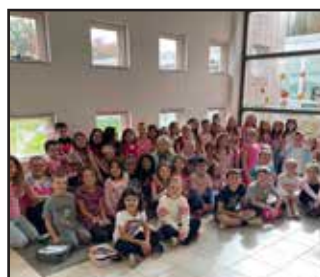
Students wore pink to help raise awareness for cancer.