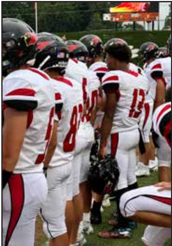
Friday night lights - our football team made it to the district finals.