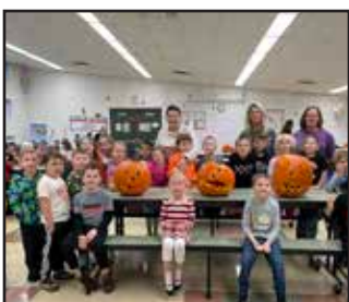
Kindergarten students participated in a fun, hands-on Pumpkin Math activity with parent volunteers.