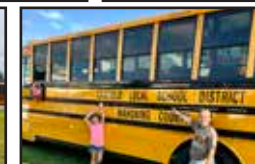
One of our new school buses is proudly displayed at the 2023 Canfield Fair.