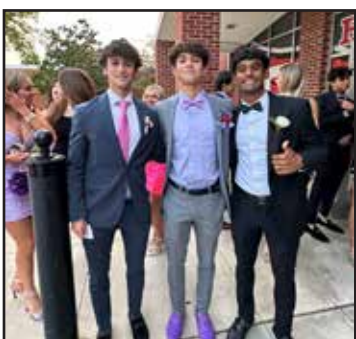
Homecoming Dance 2023.