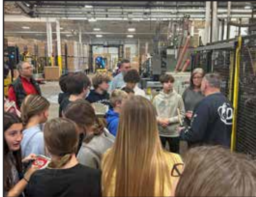
Our Physical Science students received a private tour of Dinesol Plastics, a large plastic injection molding company in Niles, Ohio.