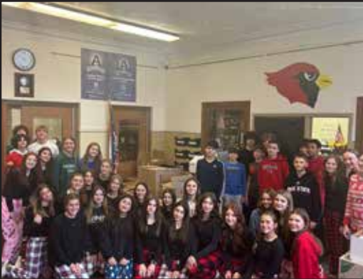
Our annual student council food drive once again was a huge success. We brought in over 2,200 pounds of food!

It has been a very busy and exciting school year thus far. Our students have been working extremely hard in the classroom. Our I-on-I device initiative has been an extremely valuable piece to the learning environment every day. We had a very successful fall athletic season with our football, volleyball and cross-country teams. Hats off to our 7/8th grade cheer squad, who has made Canfield proud! Our "Classy Card Cart" has been a big hit with our students and rewards positive reinforcement for good behavior. Our student council students have been busy with their civic-minded projects. We just completed our annual food drive with Second Harvest Food Bank and donated over 2,200 pounds of food! We are looking forward to many more great memories and activities for our students in 2024!