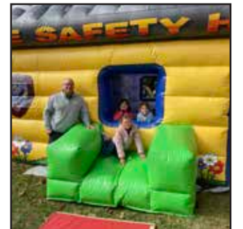
The Cardinal Joint Fire District sponsored a Fire Safety Day, including an inflatable Fire Safety House, to practice an evacuation.