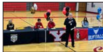
CHS student-athletes signing D1 letters of intent.