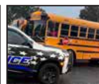
We thank the Canfield Police Department for their involvement during our bus safety day and throughout the school year.