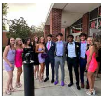
Homecoming Dance 2023.