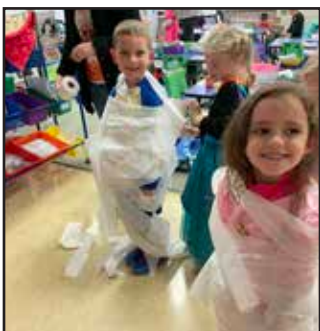
Students were wrapped up as mummies with toilet paper during our PTA-sponsored Halloween Party.