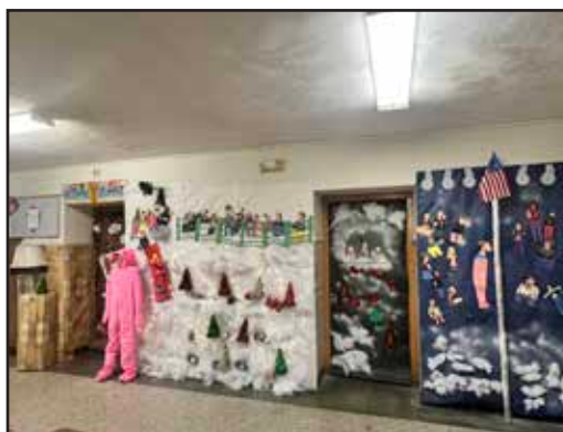
Our 3rd annual door decorating contest was another special day at CVMS. Thanks to all of our staff, students, and parents that participated.