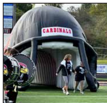
Champions' Day - celebrating Mahoning County's students with special talents.