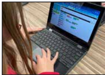
Technology in the classroom enhances student learning.

Over the course of two dedicated staff professional development days, our team underwent comprehensive training encompassing various essential domains, including vocabulary instruction, technology integration, artificial intelligence, assessment methodologies, literacy materials, mathematics, subject-specific content pedagogy and special education.