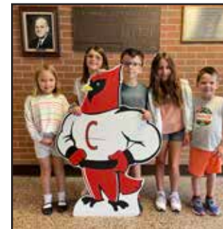
C. H. Campbell Elementary honors students who make great choices each week as our Cardinal Heroes!