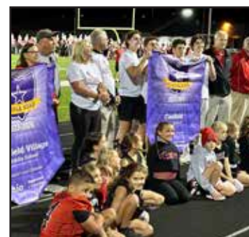
Recognizing our veterans and first responders.