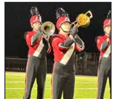
Marching band performing for the halftime show.