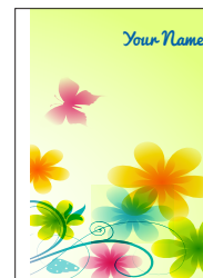
7. Bright Flowers