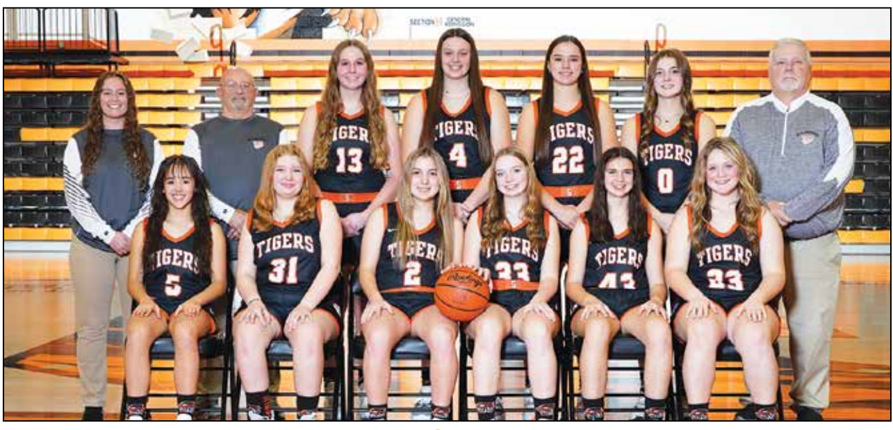
Varsity Girls Team