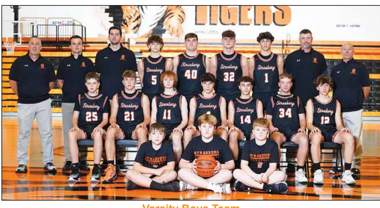
Varsity Boys Team