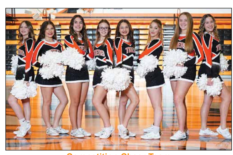
Competition Cheer Team