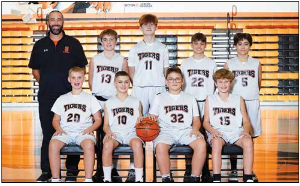
Seventh Grade Boys Team