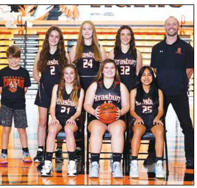
Eighth Grade Girls Team