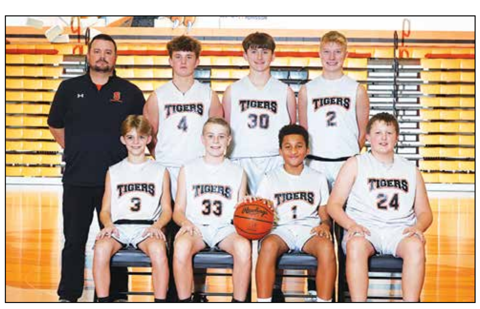
Eighth Grade Boys Team