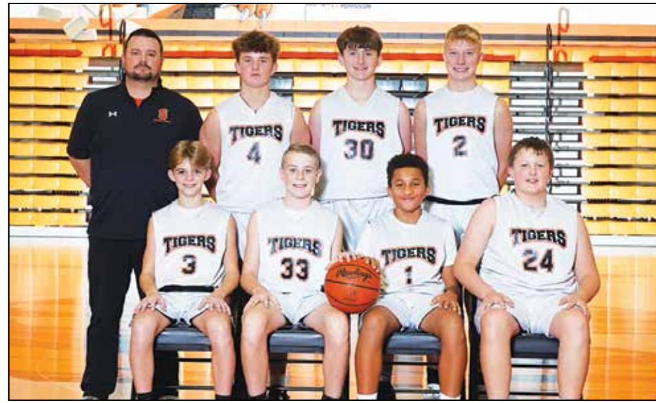
Eighth Grade Boys Team