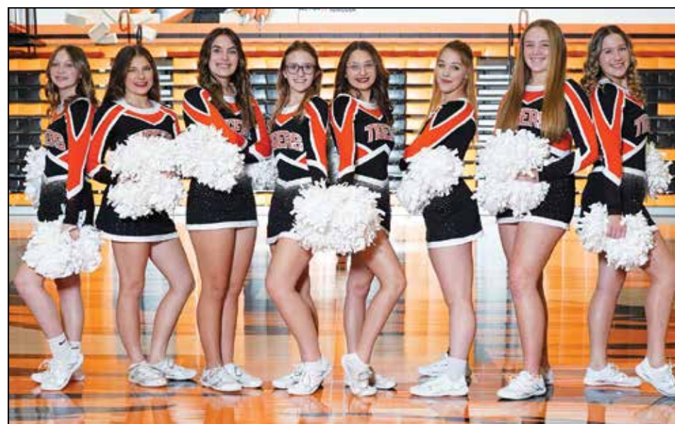
Competition Cheer Team