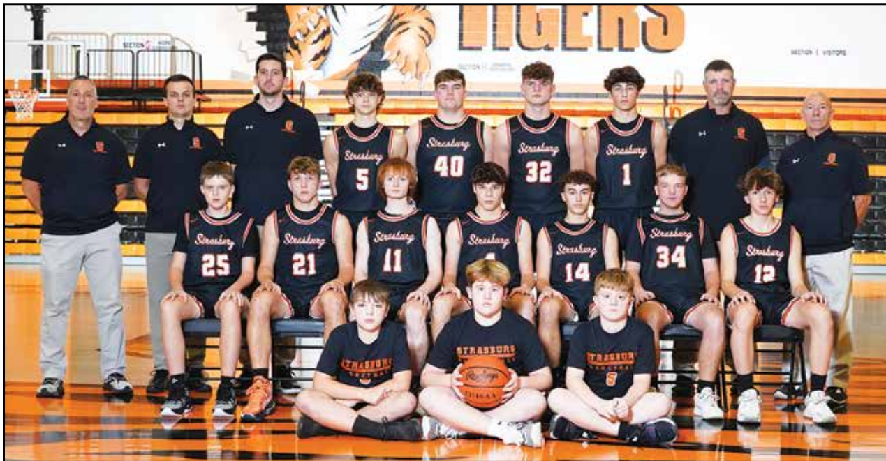
Varsity Boys Team