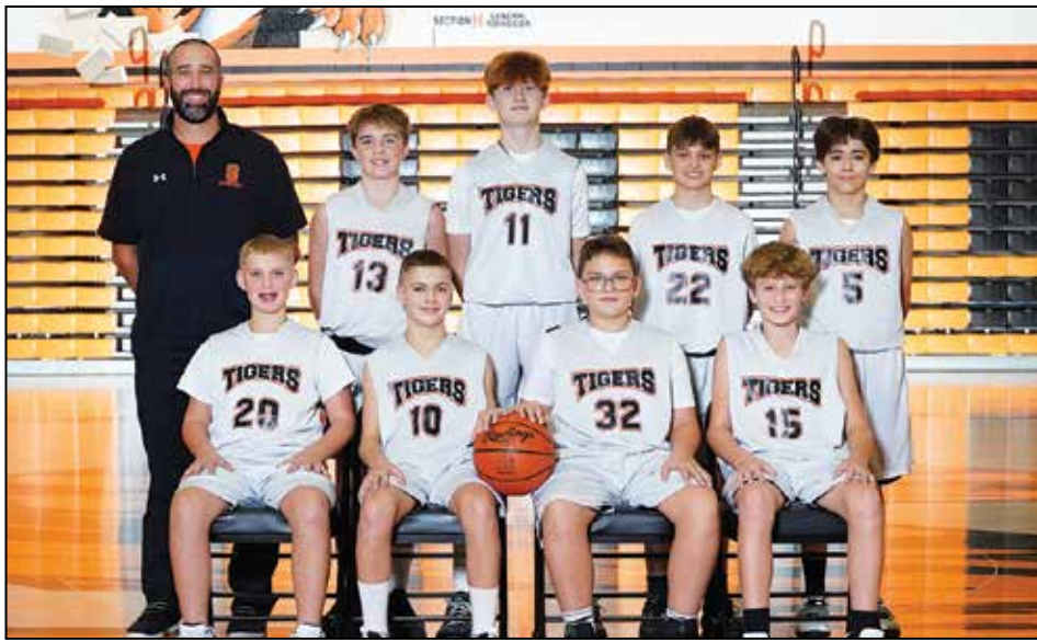
Seventh Grade Boys Team