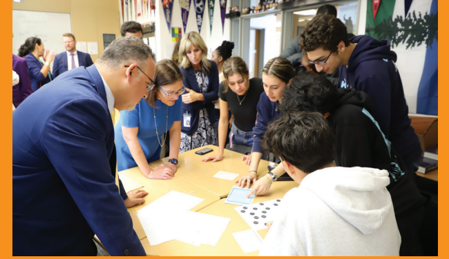
Above: U.S. Secretary of Education tours LWHS, June 9, 2023

Stops on the tour included a robotics classroom, an urban agriculture class where students discussed the importance of growing food in new and creative ways, and the LWHS student store where students are learning business management skills.