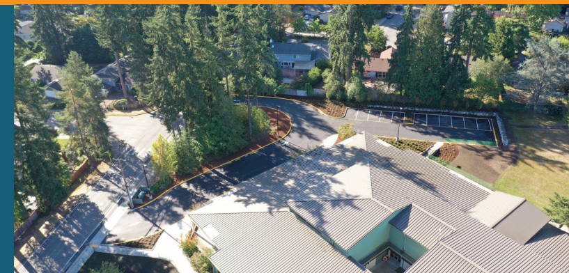
New Audubon Elementary bus loop