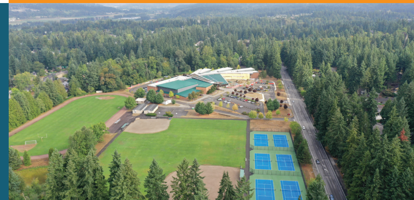
Upgraded Redmond Middle School tennis courts