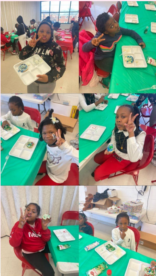
Tiny Chef Christmas Cookies

On Wednesdays, we cook! Tiny Chef is a new program where the girls make delicious treats on their own. With Tiny Chef, the girls learn how to create their own delicious snacks, follow directions to recipes, and work together by sharing materials and ingredients. This week for our Christmas party, we made holiday sugar cookies. The girls really enjoyed decorating their own cookies and ate every crumb!