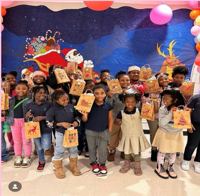
GOTR with their gift card bags