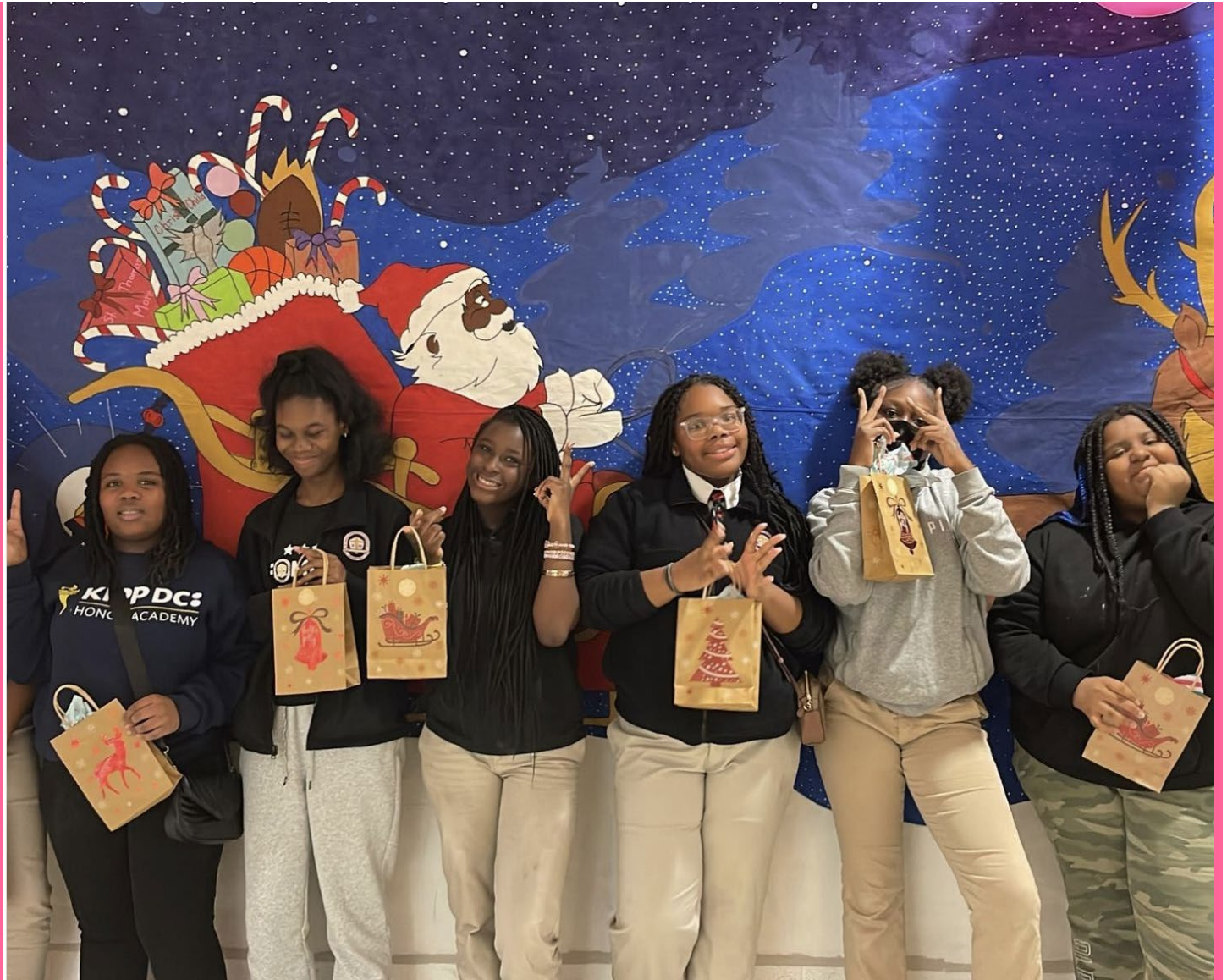
GOTR Middle School Girls with their gift card bags

May your Christmas sparkle with moments of love, laughter, and goodwill, and may the year ahead be full of contentment and joy. Have a Merry Christmas. God bless you at Christmas and always. Best wishes for a happy and prosperous New Year.