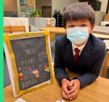
Engage for Growth