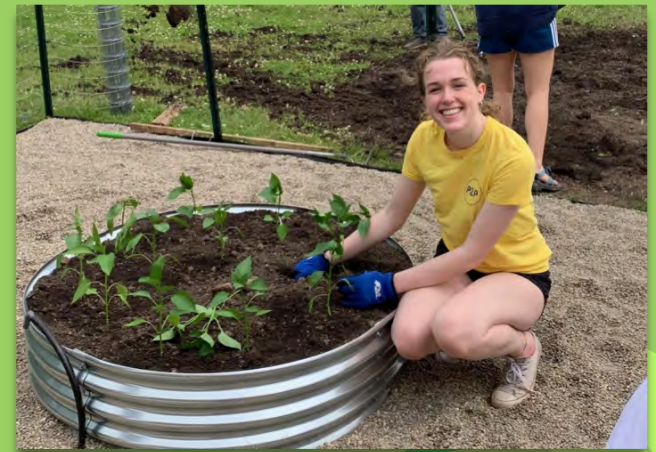
Adding soil and planting