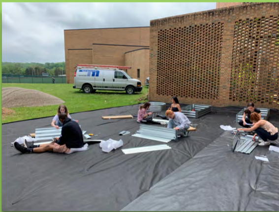
Student volunteers build the raised beds.

2019 Chartwells School Garden Mini-Grants - June 19, 2019