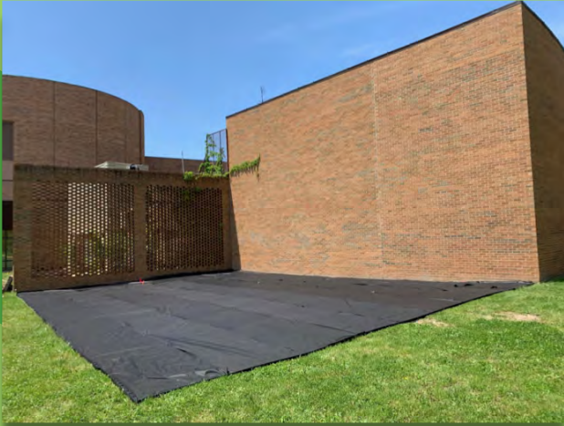
Work began on Memorial Day.