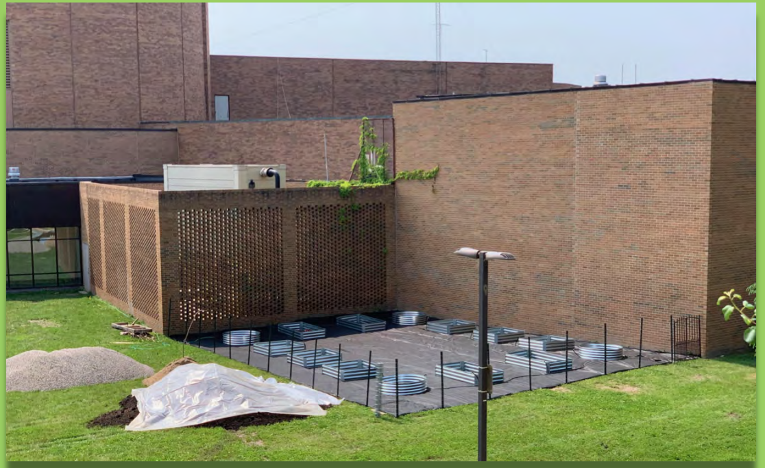
After three days of work, the garden was halfway built!

2019 Chartwells School Garden Mini-Grants - June 19, 2019