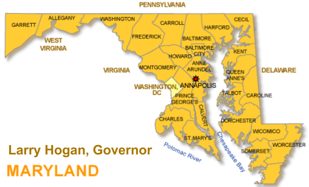
Larry Hogan, Governor MARYLAND

“ We could have allowed the state to be paralyzed by partisan gridlock. Instead, we have spent the past four years working together to tackle common problems by accepting our shared responsibility to solve them. ”