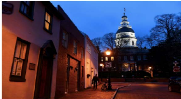
The Maryland statehouse in Annapolis in April 2018.