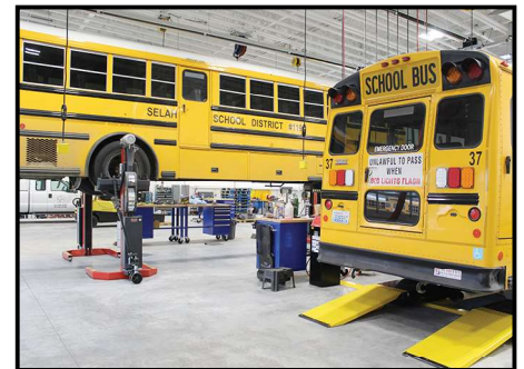
A look at the District's new cooperative transportation facility.