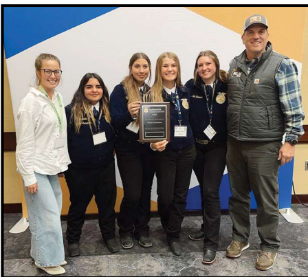
Selah FFA was honored this fall for placing in the top ten for horse evaluation at the National Horse Evaluation CDE Event.

It's a good thing these Selah High School students like to "horse around" because earlier this fall they were honored at the national level for their work!