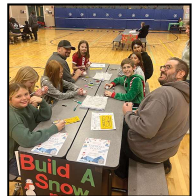
Polar Express learning fun at Selah Intermediate School.

Students and families were all aboard at Selah Intermediate School as they embarked on learning fun during December's kindergarten through fifth grade Polar Express engagement night. As students boarded the festive Express, they received a golden ticket to be punched at each classroom and school location where they engaged in literacy, math games, and science activities. Through their North Pole excursion, students enjoyed the magic of learning and winter fun.