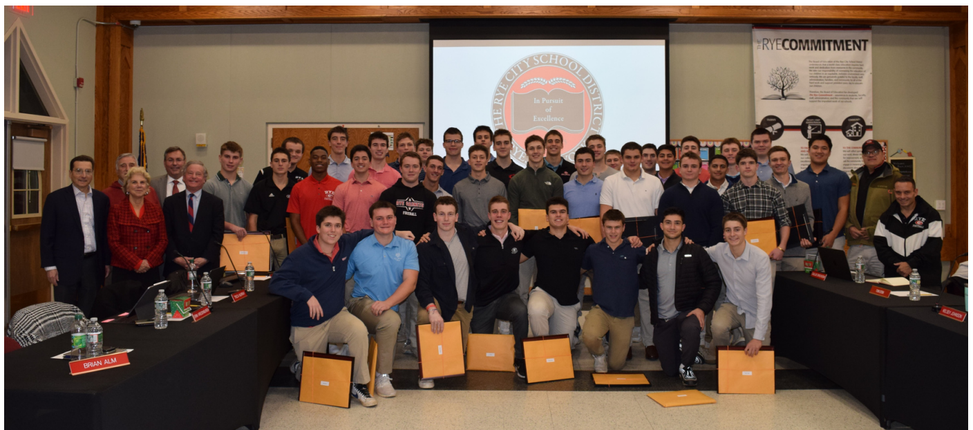
The varsity football team and JV players who were called up to play in the postseason received Rye Recognition of Excellence awards at the December 19 Board of Education Meeting