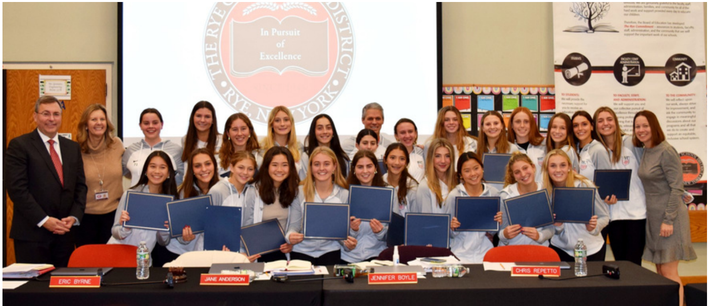
The varsity girls soccer team received Rye Recognition of Excellence Awards at the December 5 Board of Education Meeting