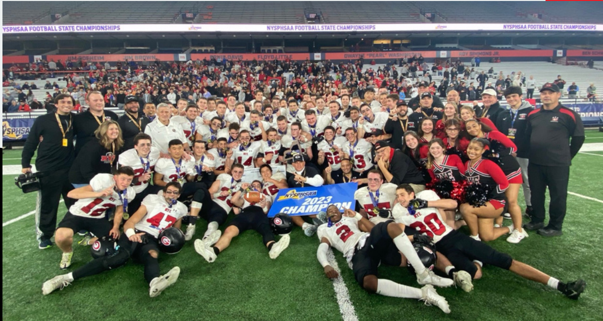
Boys varsity football team celebrating their State Championship on December 3