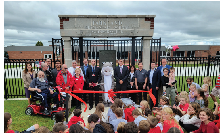
Above: Schnecksville Elementary School renovation and addition ribbon cutting ceremony was enjoyed by many, including their shark mascot!

On the school safety and security front, we are pleased to announce an upgrade to our security cameras across the District to incorporate artificial intelligence (AI) technology that can detect when a person is carrying a gun or other weapon on campus. Viewing this as an extension of our security team, the new technology monitors our cameras day and night for the threat of a brandished gun within camera views.